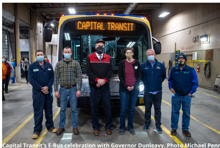
Capital Transit's E-Bus celebration with Governor Dunleavy.

Our new electric bus arrived and we are planning the charging infrastructure for future electric buses. Construction on the Valley Transit Center has begun and we are very excited to have this center for passengers to park their cars or store their bikes while they ride. Having this as a new transfer center will give Capital Transit the opportunity to revise time schedules more efficiently. Capital Transit is evaluating our fare collection process to help improve customer service.