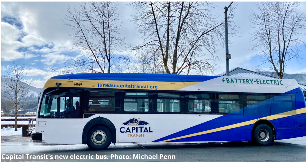
Capital Transit's new electric bus.

Since 1970, Capital Transit has provided public transportation for the city of Juneau. Our fixed-route services offer passengers quick, convenient travel between downtown Juneau, the Mendenhall Valley, and the Douglas area. Through the CAPITAL AKcess service, we provide comparable service for individuals whose disabling conditions prevent their use of fixed-route service.