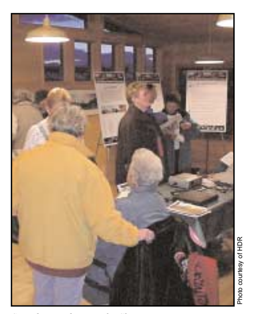
Corridor residents in the Sheep Mountain area attending the open house