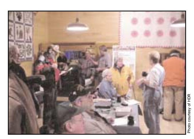
Public Open House and presentation at Sheep Mountain Lodge

Not only were people accepting of the concept, they were eager to share their stories of the Byway, their favorite places and events on the Byway, and give their time to making this effort a success.