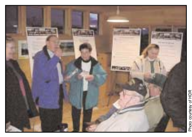
Public information boards and packets at the open houses helped to describe the National Scenic Byway Program

These meetings were advertised in three area newspapers up and down the corridor over several weeks, which increased our turnout. In addition to the newspaper ads, flyers were posted at several of the local post offices, community buildings, and roadhouses. Once a draft was available it was posted to the World Wide Web and again ads were run in local newspapers up and down the corridor. This approach proved extremely effective and generated over 30 pages of comments for consideration in the final document.