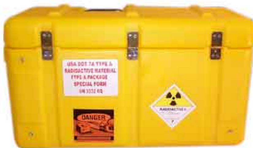
Back of Case