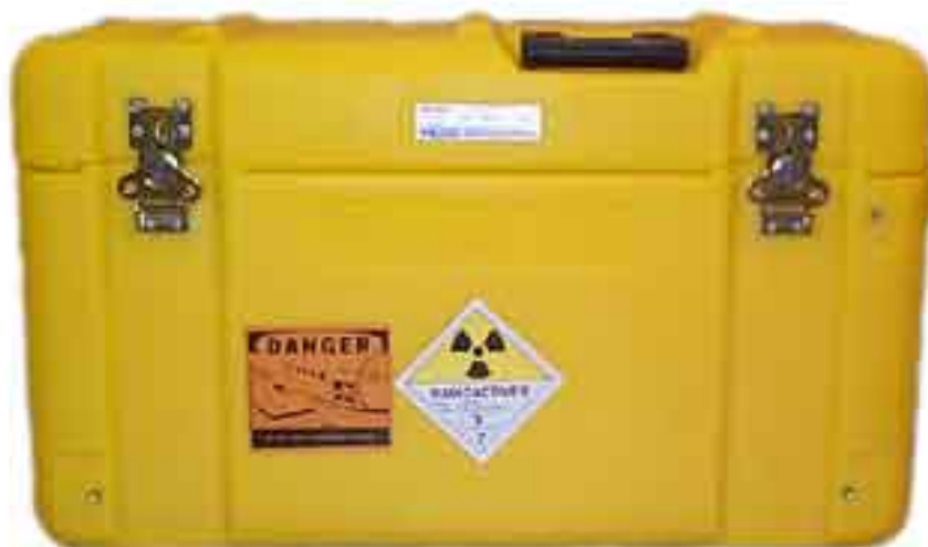
Front of Case