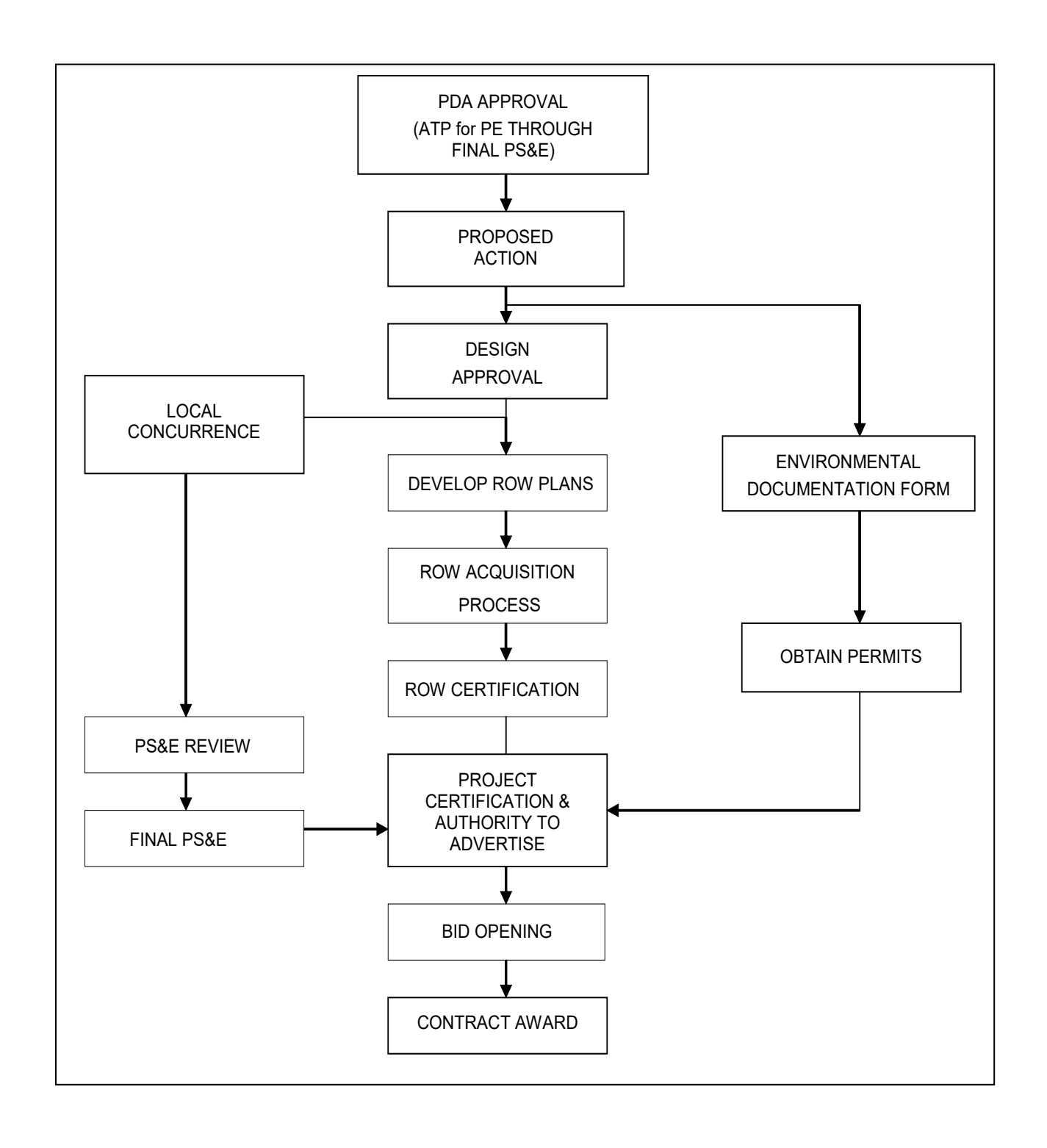
Figure 490-1 State Funded Design Process