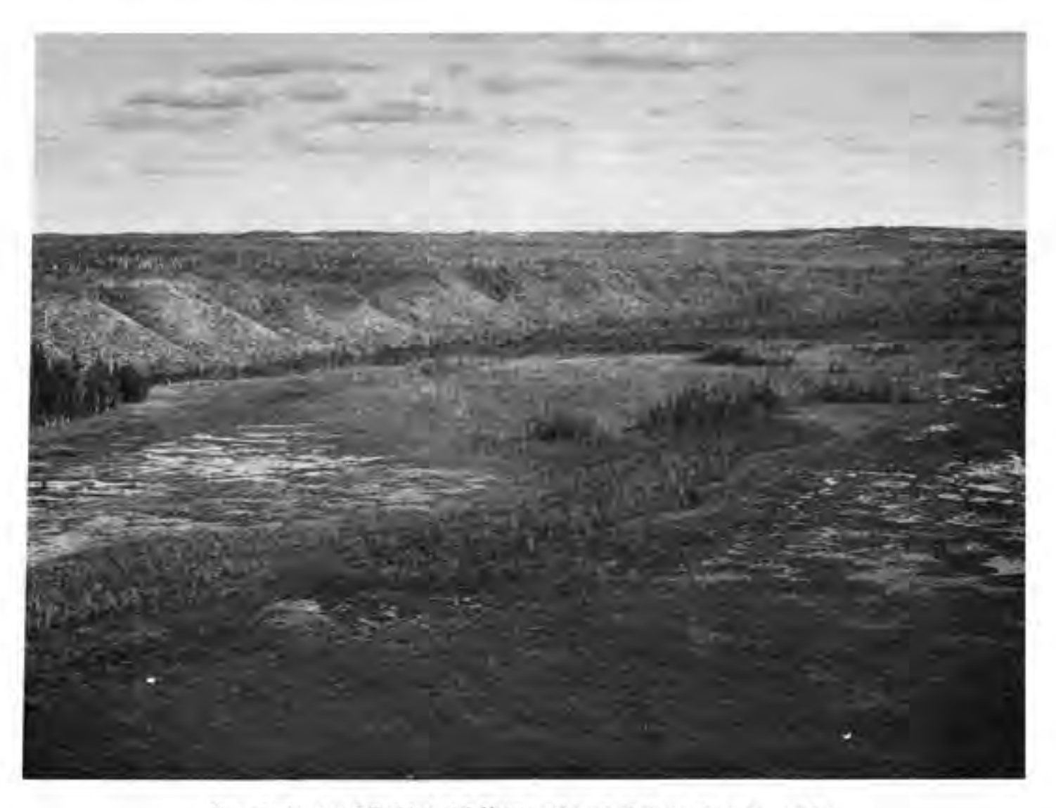
Figure 5 .- An area of Kantishna peat. Mosses and marsh plants are the main vegetation.

Typically, the surface is covered with a mat of sedges and roots about 9 inches thick. The surface layer is black mucky silt loam 2 inches thick. The subsoil is dark gray and olive gray silt loam 19 inches thick.