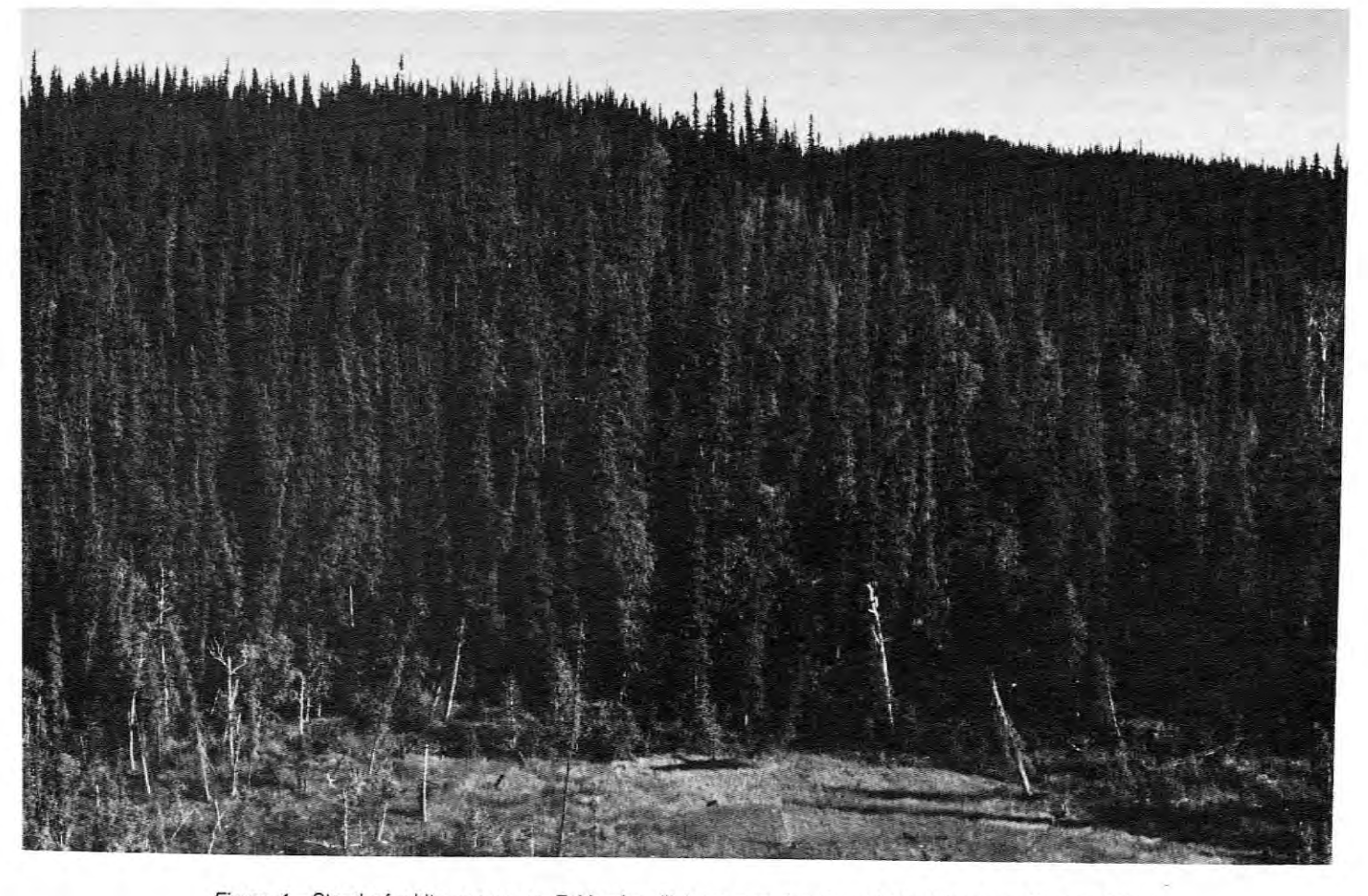
Figure 4.-Stand of white spruce on Fairbanks silt loam near junction of Kantishna and Tanana Rivers.

9—Goldstream silt loam. This deep, poorly drained soil is on broad alluvial plains and in depressional areas on outwash plains. It formed in silty alluvium. Slope is 0 to 3 percent. The native vegetation is mainly sedge tussocks, low-growing shrubs, moss, and some black spruce and tamarack. Elevation is 300 to 500 feet.