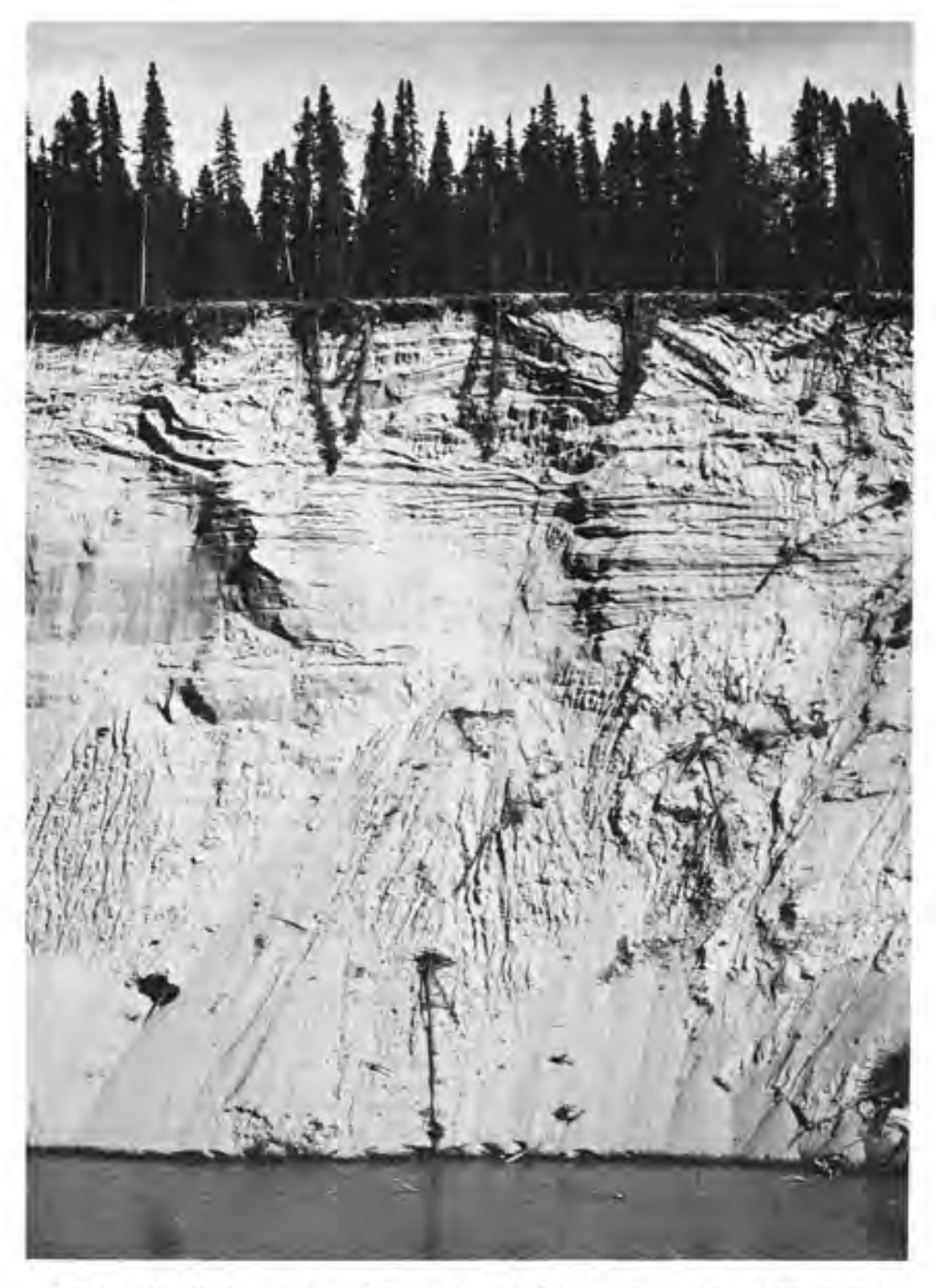
Figure 1 .- Natural erosion where Toklat River cuts into proglacial outwash plain of stratified sandy material.