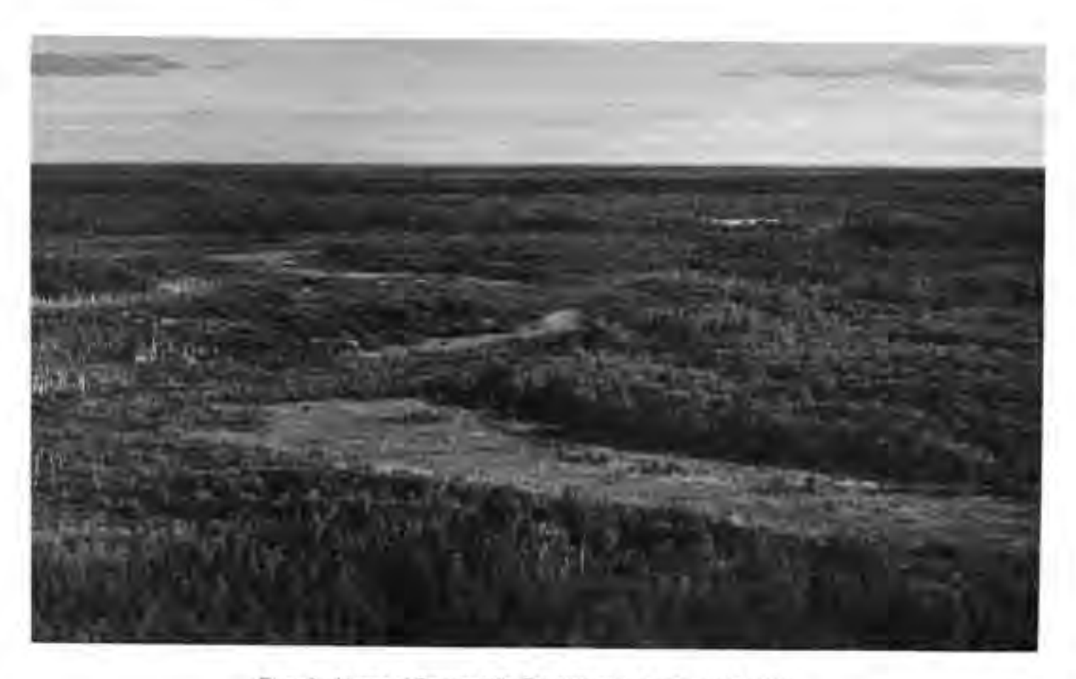
Figure 3 .- An area of Bradway soils. The plant cover is willows and sedges.

Permeability of this Bradway soll is moderately rapid above the permafrost. Available water capacity is moder-