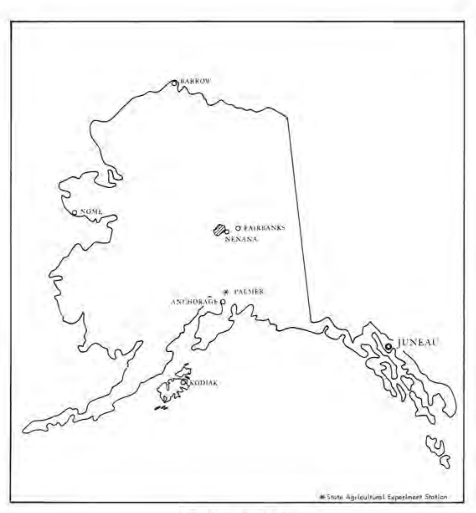
Location of Totohaket Area in Alaska.