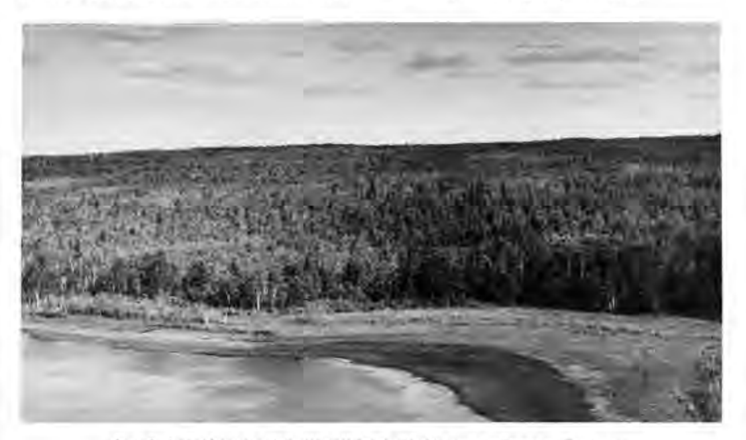
Figure 2.-- A mixed forest of guaking aspen, paper birch, and white spruce on Nenana and Beales soils.

This map unit is in capability subclass IVe.