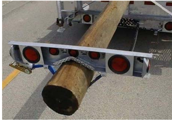
Example of an Extended Light Bar

8.2.2.3 Must have either an extended light bar or a rear pilot/escort vehicle.