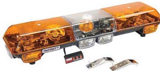
Examples of Approved Amber Beacon and Light Bar

2.6.4 RADIOS: All permitted vehicles requiring a pilot/escort vehicle, except roaded construction equipment and other specialized vehicles, shall be equipped with an operating Citizens Band (CB) radio. Company radios may also be used in addition to the CB radio for inter-vehicle communication.