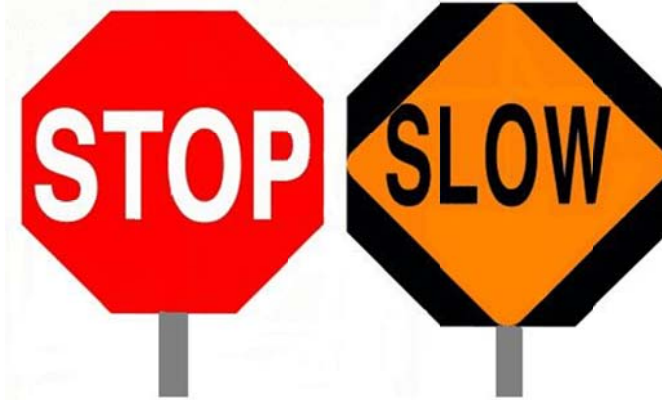
Approved Stop/Slow Paddles