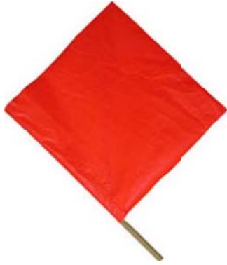
Approved Red Flag