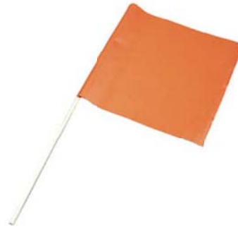
Approved Fluorescent Orange Flag

2.6.3 BEACONS: When specified, the permitted vehicle's beacon or light bar shall be amber in color and shall be of a high-intensity rotating, flashing, oscillating, or strobe style. The beacon shall be roof mounted or mounted as close to the vehicle's roof line as practical. The beacon/strobe shall be visible for a minimum of 500 feet, shall be visible through a full 360 degrees and shall be maintained for operability.