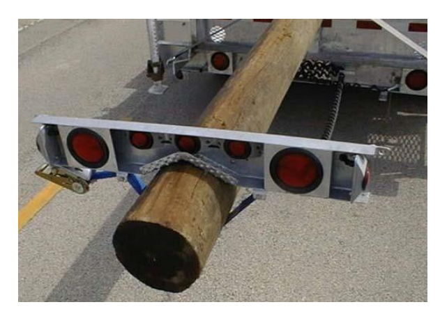
Example of an Extended Light Bar

8.2.2.4 Are subject to peak traffic restrictions.