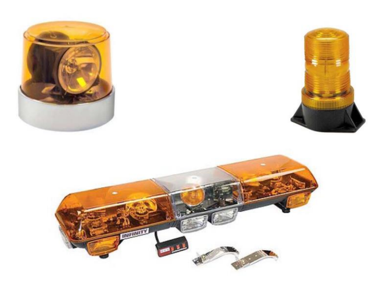
Examples of Approved Amber Beacon and Light Bar

2.6.4 RADIOS: All permitted vehicles requiring a pilot/escort vehicle, except roaded construction equipment and other specialized vehicles, shall be equipped with an operating Citizens Band (CB) radio. Company radios may also be used in addition to the CB radio for inter-vehicle communication.