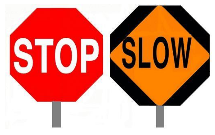
Approved Stop/Slow Paddles