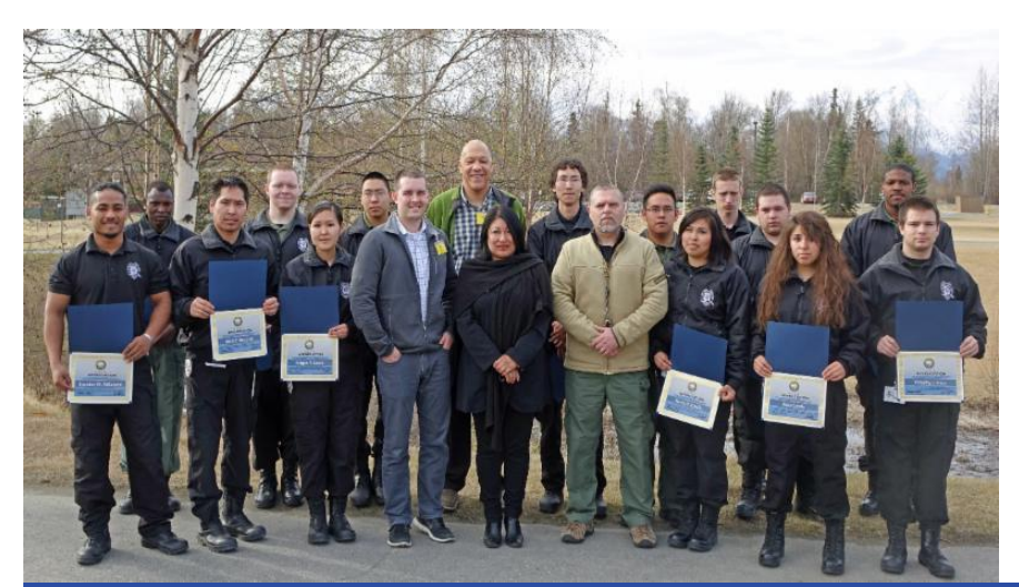
DBE/OJT Support Services Update: Quality Assurance Reviews

On Friday May 1, the Civil Rights Office (CRO) visited Alaska Job Corps (AJC) in Palmer, Alaska and presented certificates of achievement to 14 security students. The certificates that were presented acknowledged the student's efforts in the Alaska Construction Career Days (ACCD) event hosted at the Palmer Fairgrounds on April 22, 2015. The AJC security student's efforts were greatly appreciated and resulted in the success of the event. The CRO would like to highlight their services and thank them for their hard work.