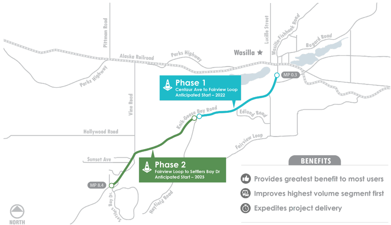
Figure 2: Construction Phasing Plan