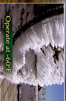
Operate at -60°F