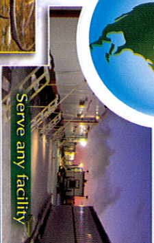
Serve any facility