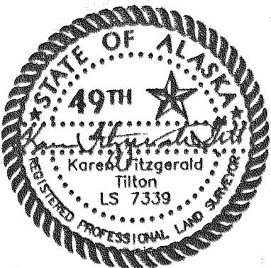
CONSULTANT RIGHT-OF-WAY SURVEYORS' CERTIFICATE

THIS SURVEY DOES NOT CONSTITUTE A SUBDIVISION AS DEFINED BY AS 40.15.900(5).