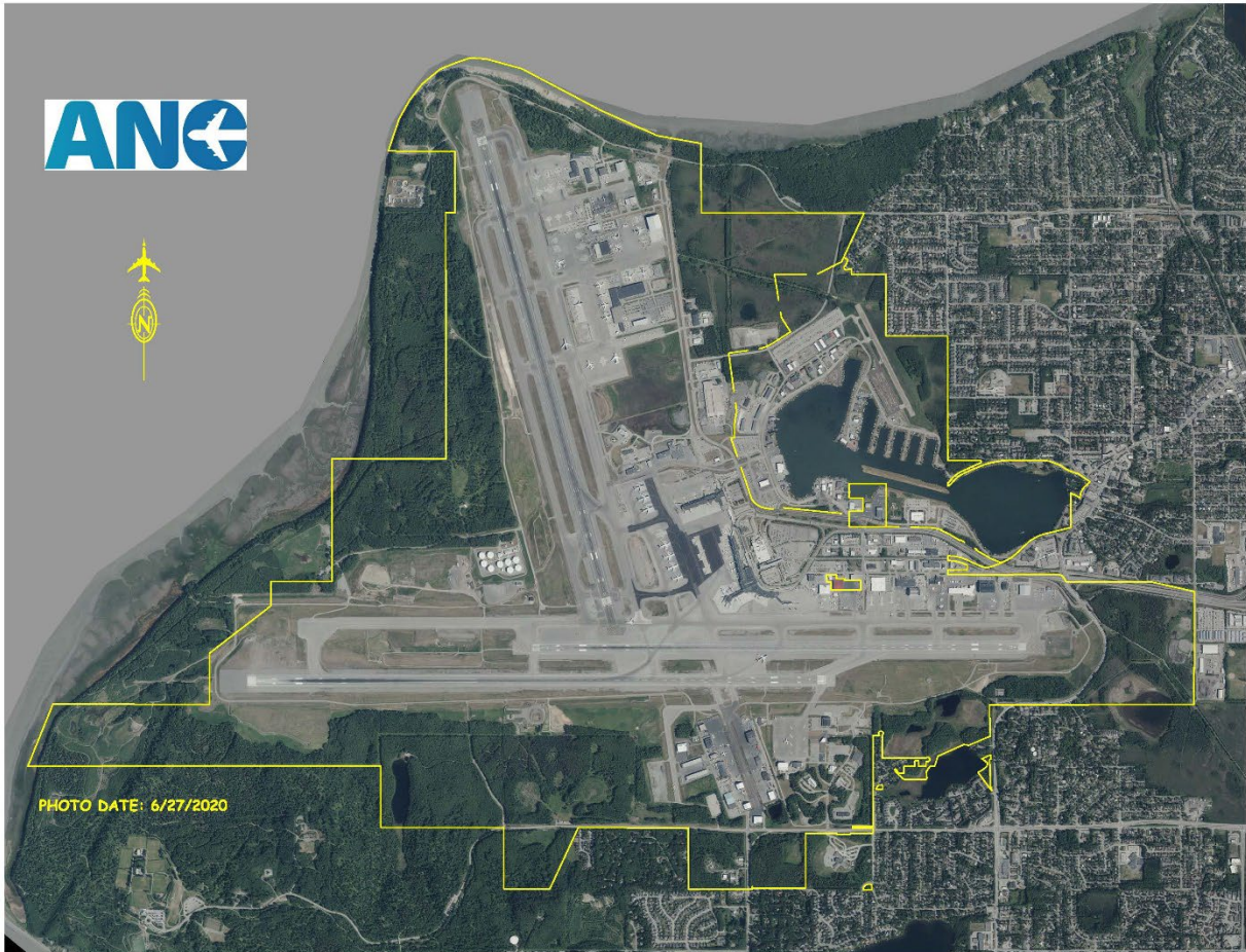
Figure 1 Airport Boundary Map