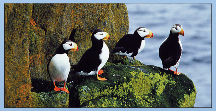
Aleutian Chain, Alaska