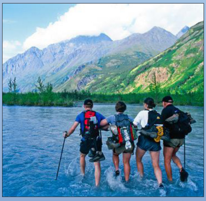
Eagle River Alaska