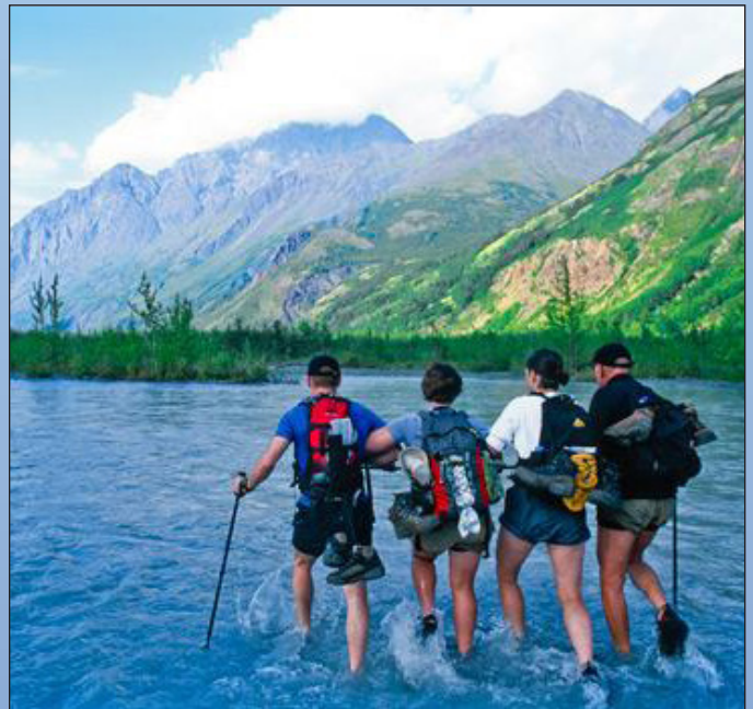
Eagle River Alaska