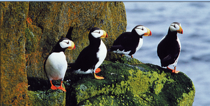
Aleutian Chain, Alaska