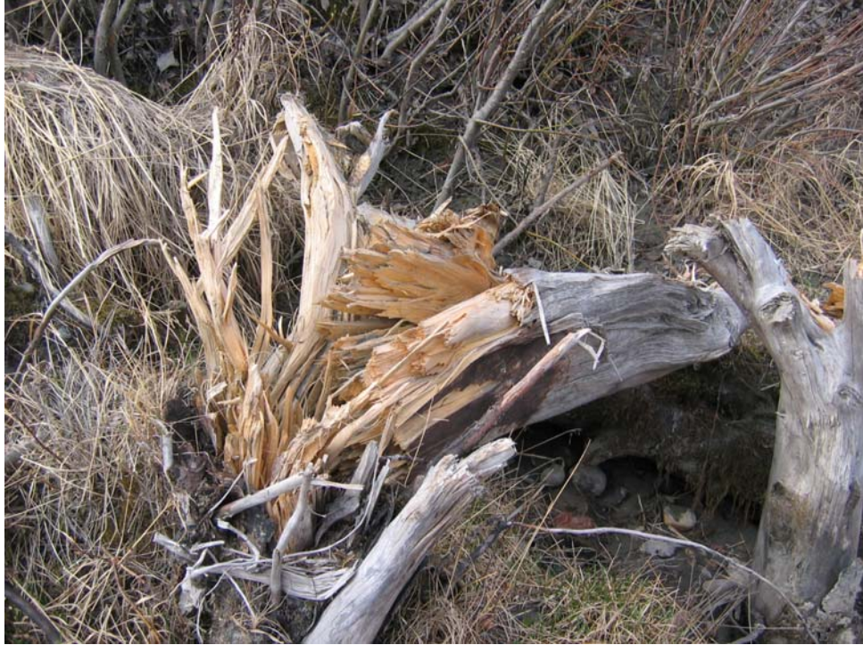
Figure 5. Root wad with damaged root tines at Centennial Park.

With one exception, the boles appeared to be undamaged in any way. At Centennial Park, one root wad bole had been pulled away from the bank approximately 1 foot. In many root wad installations, header and/or footer logs are used to secure and anchor the individual boles. However, such logs were not used in this section of the Centennial Park project.