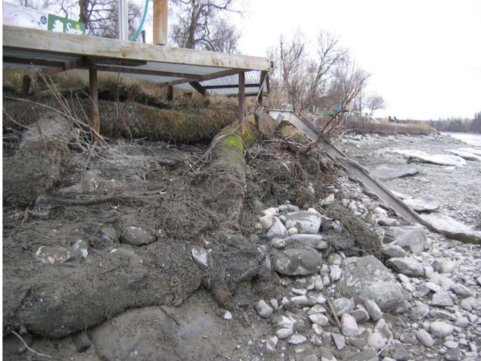
Figure 11. Ice damage to coir log installation.

The Soldotna Lodge root wad installation described earlier also includes a spruce tree revetment section, located downstream from the root wad section. The spruce trees cabled to the bank appeared to be in excellent condition, and were not damaged by the ice jam event. See Figure 12.