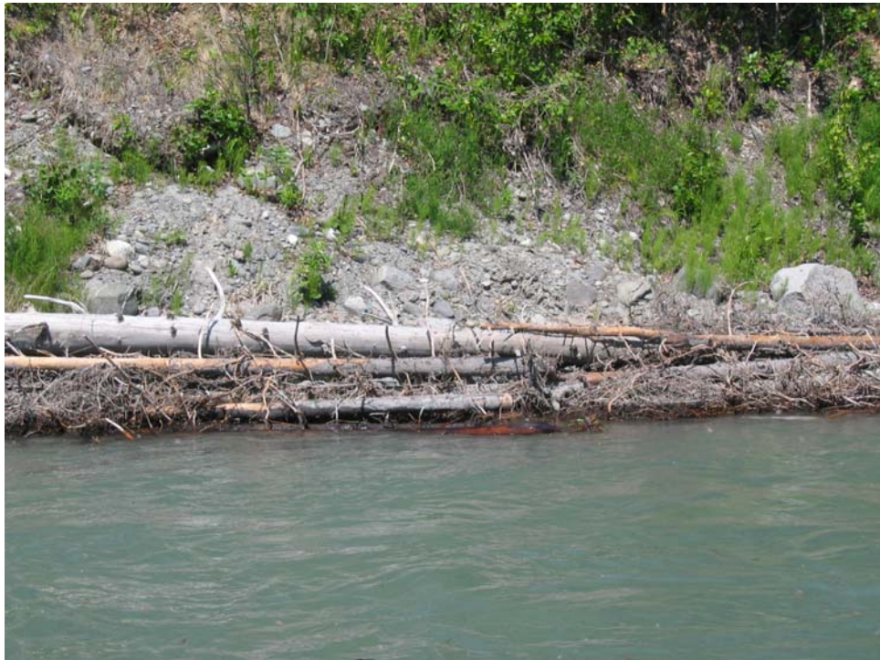
Figure 12. Spruce tree revetment at Soldotna B&B Lodge.

The Soldotna Lodge root wad installation described earlier also includes a spruce tree revetment section, located downstream from the root wad section. The spruce trees cabled to the bank appeared to be in excellent condition, and were not damaged by the ice jam event. See Figure 12.