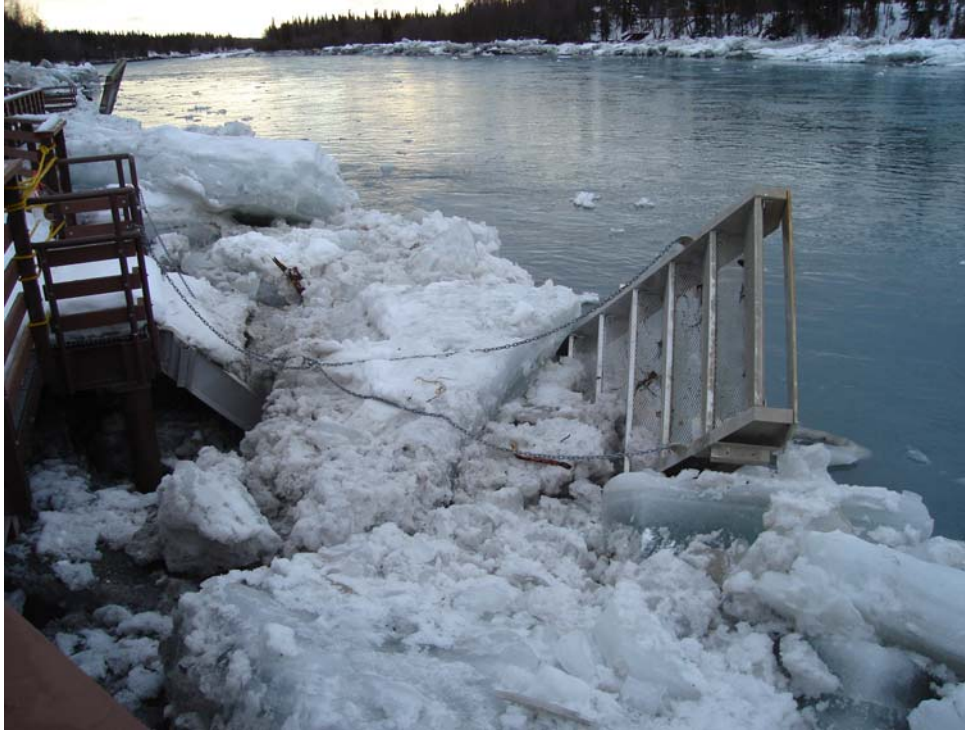
Figure 4. Damaged folding aluminum staircase at Soldotna Park.