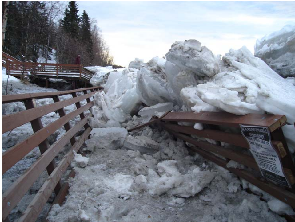
Figure 1. Elevated walk at Soldotna Park damaged by ice jam event, January 2007.