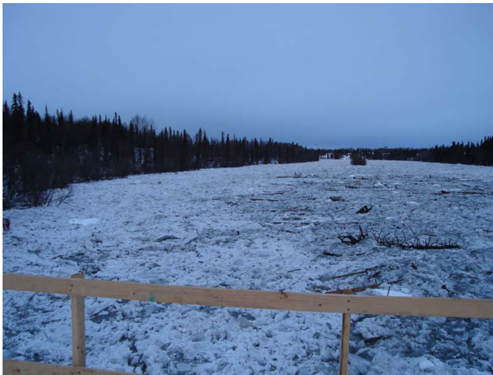
Figure 2. Ice jam on the Kenai River January 28, 2007.

The lake began releasing around January 16. The Kenai River at Skilak Lake rose about 3.8 feet beginning on January 18, and experienced a broad crest below Skilak Lake on January 27 (Kenai Borough, 2007). The rise in water levels caused the existing ice cover on the Kenai River to break up and form a series of ice jams that moved downstream over a period of several days, causing localized flooding in the Soldotna vicinity. Ice jams were noted upstream of the Sterling Highway Bridge near the confluence of Soldotna Creek; that ice moved downstream and jammed at the Sterling Highway Bridge by January 29. The bridge jam broke loose and moved downstream early January 30, allowing the water level at the bridge to decrease from 20 feet to 11.20 feet, which is just under flood stage. Ice was jammed at Centennial Park on the morning of January 30, but open channels allowed water to flow through and not back up behind the jam (Peninsula Clarion, 2007). By the afternoon of January 30, the Centennial Park jam cleared and reformed downstream near Slikok Creek, two miles below the Sterling Highway Bridge; this jam was over a mile in length (DHS, 2007). See Figure 2.