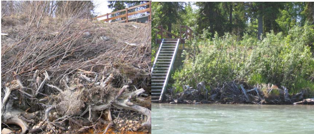
Figure 9. Upper bank brushlayering at Centennial Park. Left photo taken May 2007, right photo taken June 2007.

At the Centennial Park root wad installations, the upper bank above the root wads appeared to be well-protected by the willow trees growing there. The willows, planted as part of the brush-layering structure built on top of the root wads, are up to 1.5" diameter breast height (dbh), and up to 12 feet in height. During the May 2007 field visit, many of the willow trees were severely bent over in a downriver direction. This appeared to be the result of the ice-jam event; ice floes either knocked the willows over as they moved downstream, or flattened them as the water levels receded and the floes were left on the bank. During the late June visit, the vast majority of the willows appeared to be healthy. Stalks had straightened out, and were in the process of leafing out. See Figure 9.