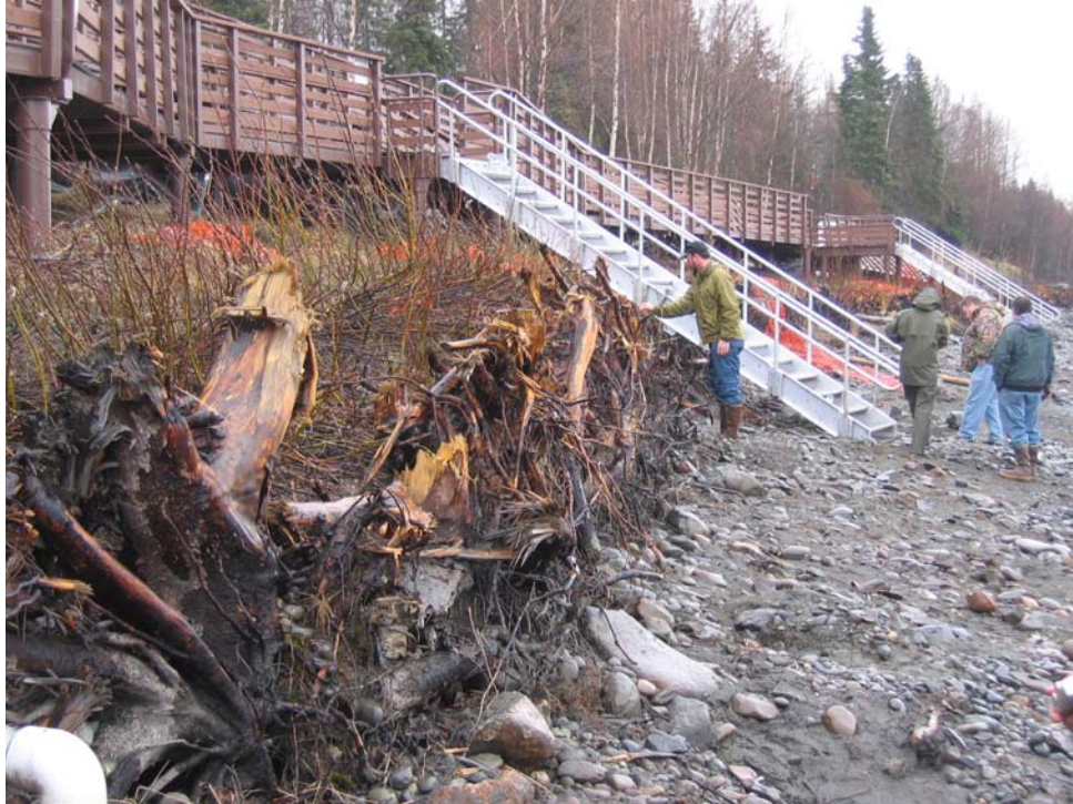
Figure 7. Root wads with broken root stems at Soldotna Park.

four years old. Though some root tines were broken, most of the installation appeared to be in excellent condition. A tree on the bank above the root wads shows the effects of bark being stripped off the trunk by the ice floes. See Figure 8.