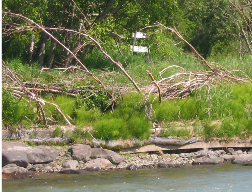
Figure 10. Bark stripped from trees at the Soldotna Park cribwall site.

The upstream section of the Soldotna Park installation was constructed in 1997, using cribwalls to protect the toe of the bank. On this bank, the trees are mature, 15 to 20 feet in height, and a 2 to 3 inch dbh. Following the ice jam, many of these trees were flattened in a downstream direction, and had much of their bark scraped off by ice floes. In June 2007, they were in poor condition, still flattened, and were not leafing. See Figure 10.