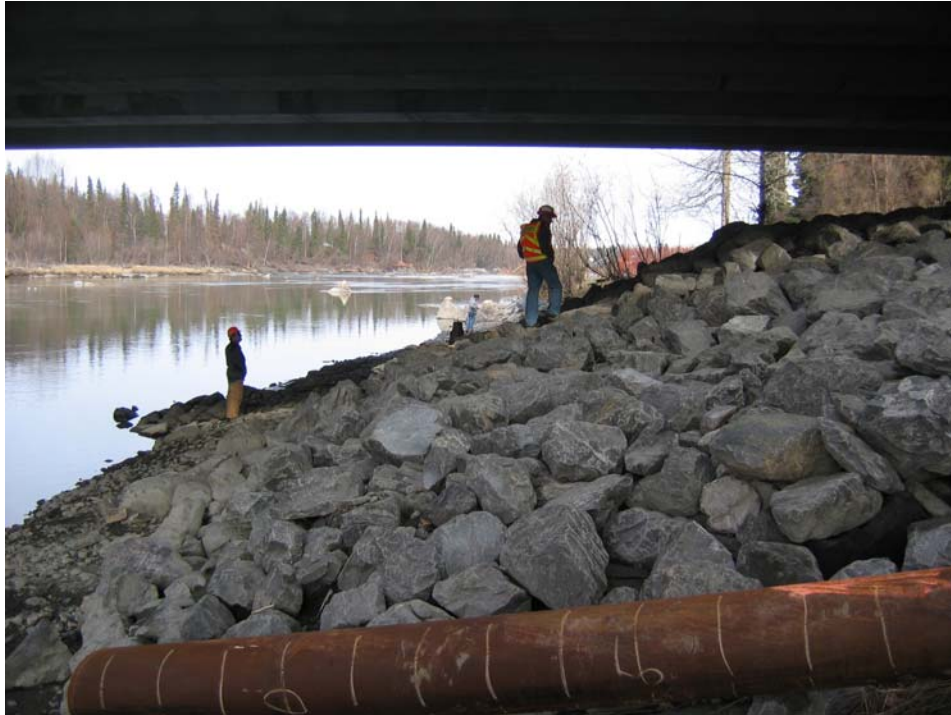
Figure 13. Riprap beneath the new Sterling Highway Bridge.

Though pre-flood photographs were not available, the post-flood inspection showed the riprap installation to be in excellent condition. There was no indication that any of the rock was displaced by either the water or the ice floe movement. See Figure 13.