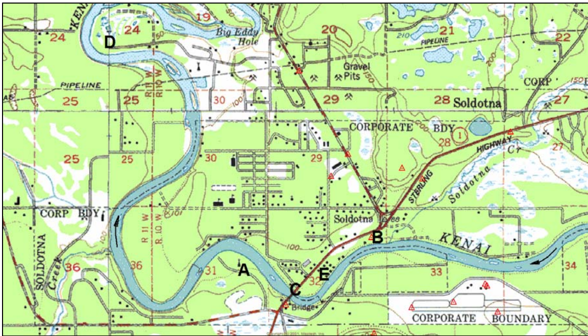
Figure 14. Map of project inspection sites along the Kenai River near Soldotna, Alaska.