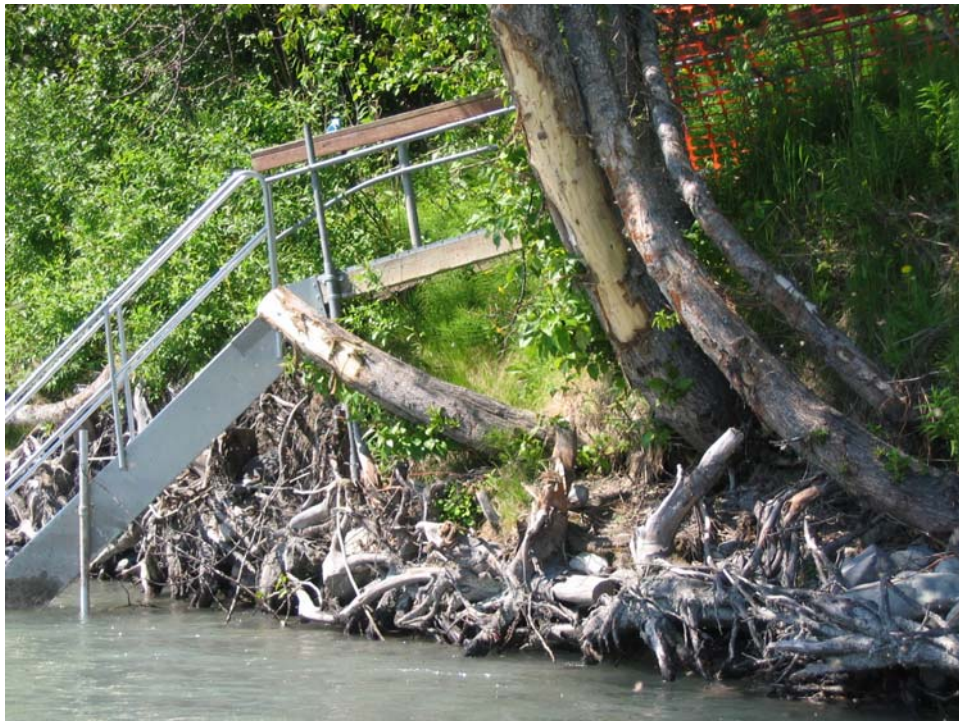
Figure 8. Root wad installation at Soldotna B&B Lodge.

four years old. Though some root tines were broken, most of the installation appeared to be in excellent condition. A tree on the bank above the root wads shows the effects of bark being stripped off the trunk by the ice floes. See Figure 8.