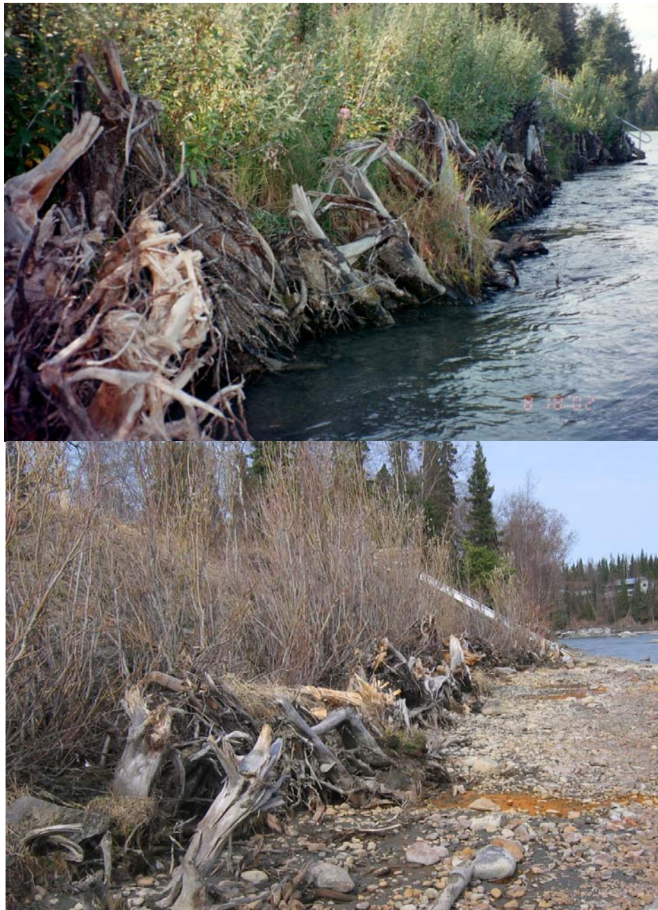
Figure 6. Root wads at Centennial Park. Top photo taken July 2002, bottom photo taken May 2007.

Root wads at Soldotna Park were installed in the spring of 2006. These root wads also showed signs of damage, though not as severe as the Centennial Park site. Again, root wads suffered damage to the roots or tines forming the wad, and the boles appeared to be undamaged. Header logs were used at this site. See Figure 7.