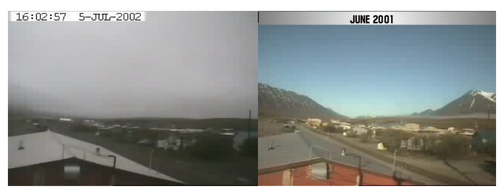
FAA weather camera photos. Right photo shows clear day image of Anaktuvuk Pass. The image on left shows poor weather.

Most single engine airplanes cannot be flown unless the weather is suitable for Visual Flight Rules (VFR) conditions (see Appendix B). The FAA has approved certain single engine aircraft to fly IFR such as the Cessna Caravan, however these aircraft require additional equipment for that certification. When flying VFR the pilot must be able to see the ground to navigate and avoid obstacles and other aircraft. Single engine aircraft are generally used for short distance flights and smaller airstrips. They are also used for carrying lighter loads where it would be inefficient to use the larger multi-engine aircraft.