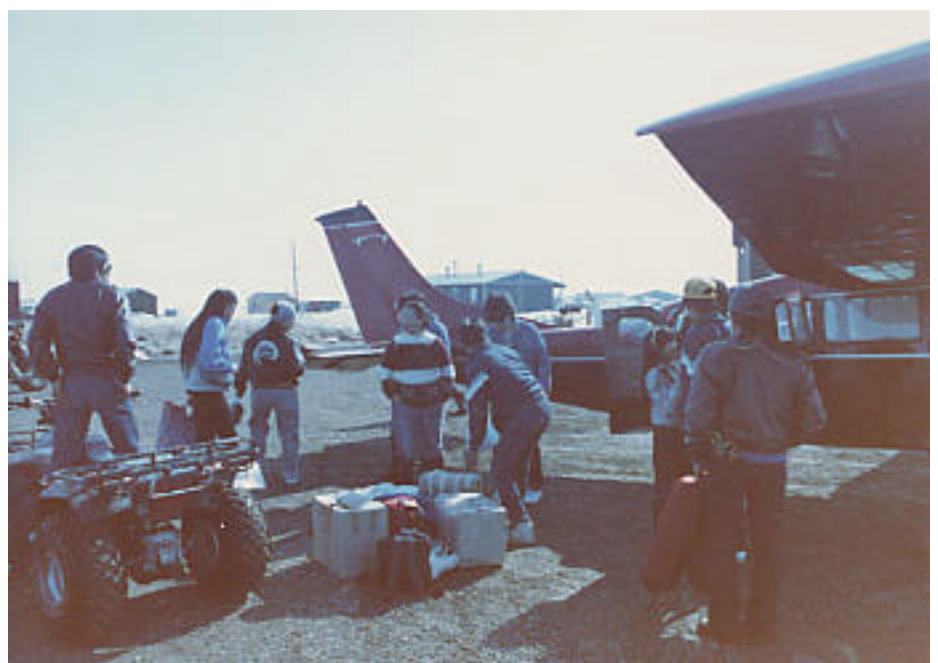
Loading luggage into a Cessna 207.

Consumers today think nothing of returning an item if it does not meet their expectations. If you pay for a service and you are not satisfied, you ask to have the job done correctly. This is the same attitude the FAA believes you should take toward air travel.