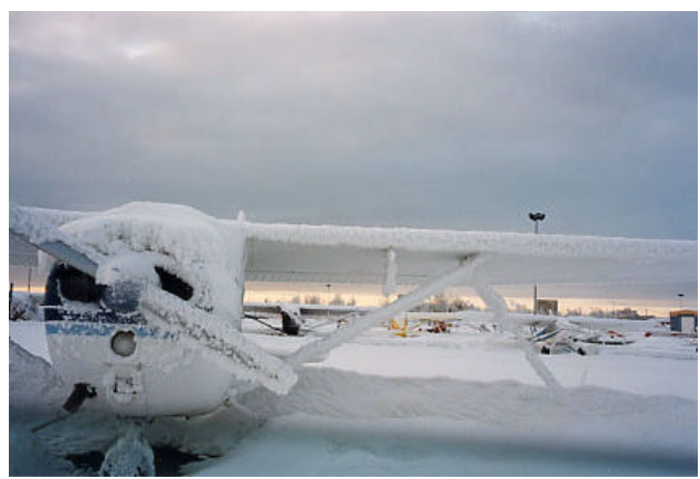
Aircraft covered with snow and ice.

Frost and ice on an aircraft pose dangers. Ice affects the shape of the airplane's wing; which disrupts the airflow. Ice adds weight to the aircraft. Even a little bit of ice can make a difference in the airflow over the wings. If you see ice on an airplane and you are in doubt about how it will affect the flight, ask the pilot.