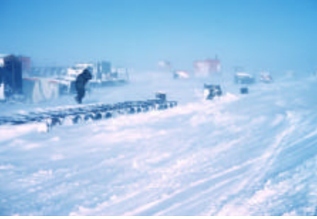
Ground blizzard.

Ground visibility can be defined as the prevailing horizontal visibility near the Earth's surface as reported by an accredited observer. Ground visibility is measured at some airports by the National Weather Service, a Flight Service Specialist or by a trained weather observer. However, many of Alaska's airports do not have human weather observers. Pilots may have to use automated weather system reports or the reports of other pilots who have recently traveled through an area. Some air carriers contact village residents for an estimate of visibility. Those observations are only suitable for VFR flights.