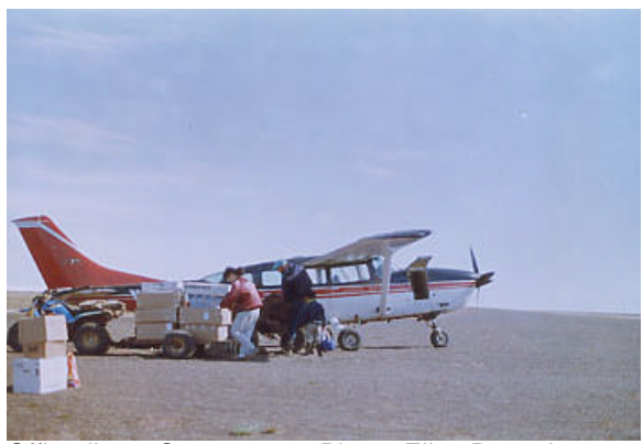
Offloading a Cessna 207.