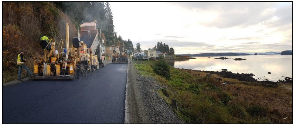
Kake Keku Road Rehabilitation Project

During the 2018 construction season, DOT&PF will continue work on several construction projects as well as break ground on numerous pavement rehabilitation, road reconstruction projects and bridge or trestle replacements.