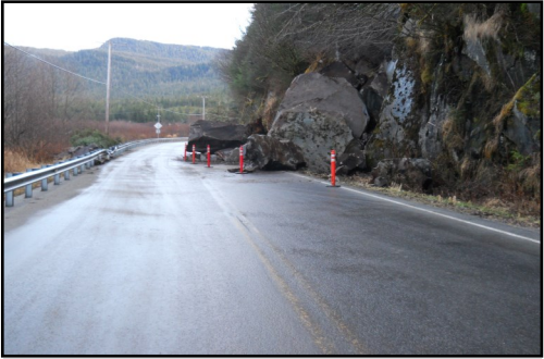
Zimovia Rock Slide

Wrangell Zimovia Highway —On Jan 18th at approximately 6:30 pm, a major rock slide occurred at 6.5 mile on the Zimovia Highway in Wrangell, blocking both lanes. The local police department notified the Wrangell Maintenance crew and the crew were on site by 7:30 pm. The crews were able to open the road up for one lane of traffic within a half hour. The remaining closed lane was opened by 4 pm the next day. Some of the boulders were so big, it took two large loaders to move them. Other boulders were broken into pieces before they were moved.