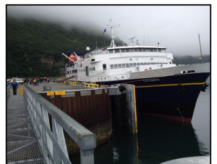
First docking of the Tustumena at the newly constructed Chignik Dock

The Chignik dock won 2017 Best Projects Award from Engineering News-Record in the Highway/Bridge category - ENR Northwest Region. DOT&PF contracted Pacific Pile and Marine (PPM) to construct a new marine docking facility to allow improved berthing and mooring for the Alaska Marine Highway System (AMHS) ferries and other vessels. The dock used open cell sheet pile design, developed by PND Engineers, to provide high load capacity with minimal sheet pile toe embedment. The design can also be modified for increased loading or unforeseen conditions and accommodates for long-term settlement. The communities of Perryville and Chignik Bay, Lake, and Lagoon have depended on the AMHS for decades. Previously, vessels tied up at the privately-owned Trident Seafoods dock which needed repairs. Without a dock, the area risked losing ferry service so the project was a top capital improvement priority for the Lake and Peninsula Borough. AMHS' M/V Tustumena completed its first docking at the facility in August. The dock is expected to provide improved access for nearby communities and encourage growth in fisheries and resource development. (Content and photo provided by PPM)