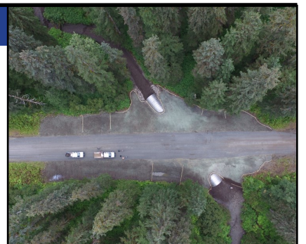
Yakutat New Fish Passage Culverts

Fish passage improvements were completed this summer. DOT&PF removed and replaced or modified culverts at four stream crossings on the Yakutat Highway that did not meet fish passage standards. These stream crossings support anadromous fish, and the culverts jeopardize their ability to access habitat upstream of the culverts. New culvert designs simulate natural stream conditions and provide adequate fish passage.