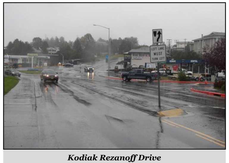
Kodiak Rezanoff Drive