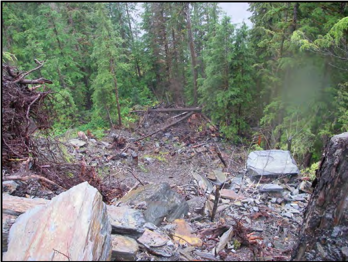
Photo 25: Sidecast fills spilling down towards the shores of Lake 340.