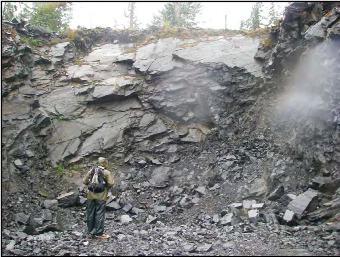
Photo 17: Quarry along the MHT logging roads with higher quality greenstone bedrock.