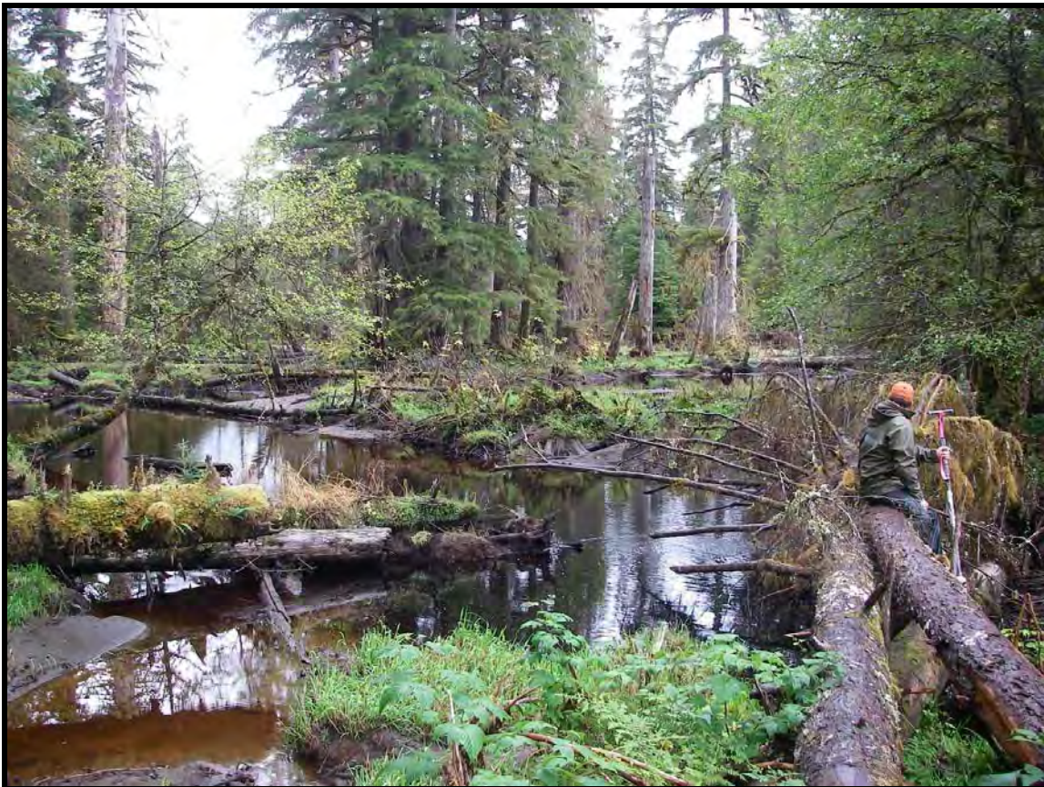
Photo 26: Tributary creek draining towards Heckman Lake. Overflow channels and beaver ponds to photo left.