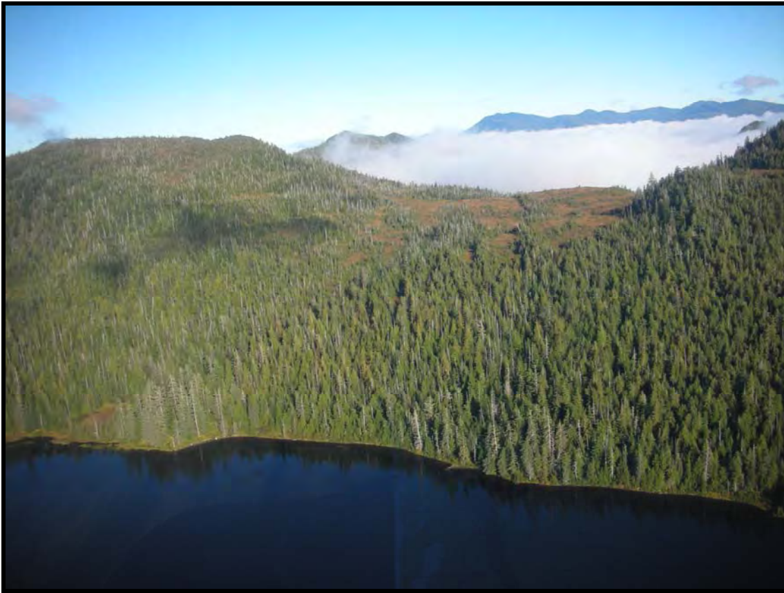
Photo 1: View north across Lake Harriet Hunt to the Harriet Hunt Ridge