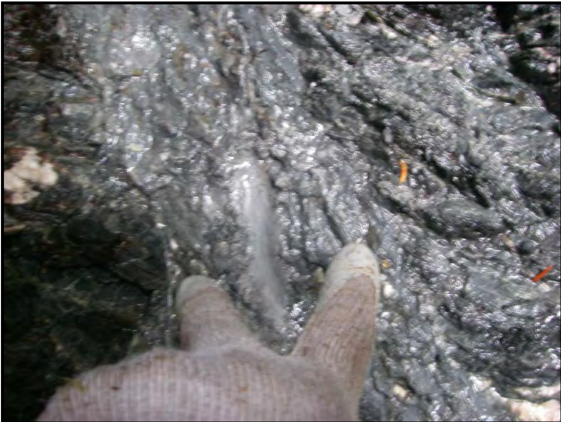
Photo 16: Close up view of a clay seam in the outcrop shown in Photo 15.