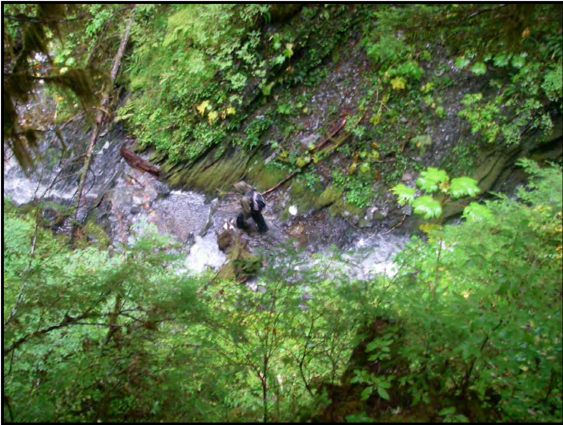
Photo 21: Typical steep sided chasms found along the north slope of Harriet Hunt Ridge.