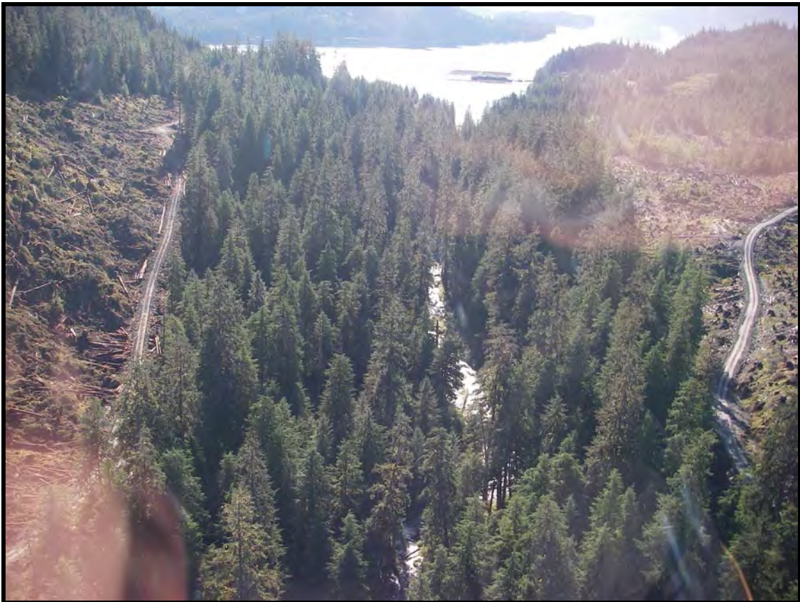
Photo 22: Leask Ck dividing the existing logging roads. Existing bridge just out of view at photo bottom.