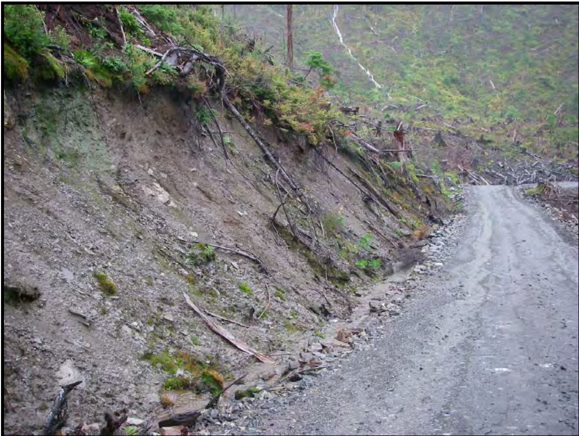
Photo 10: Colluvium soils along the MHT logging roads northeast of Leask Lakes.