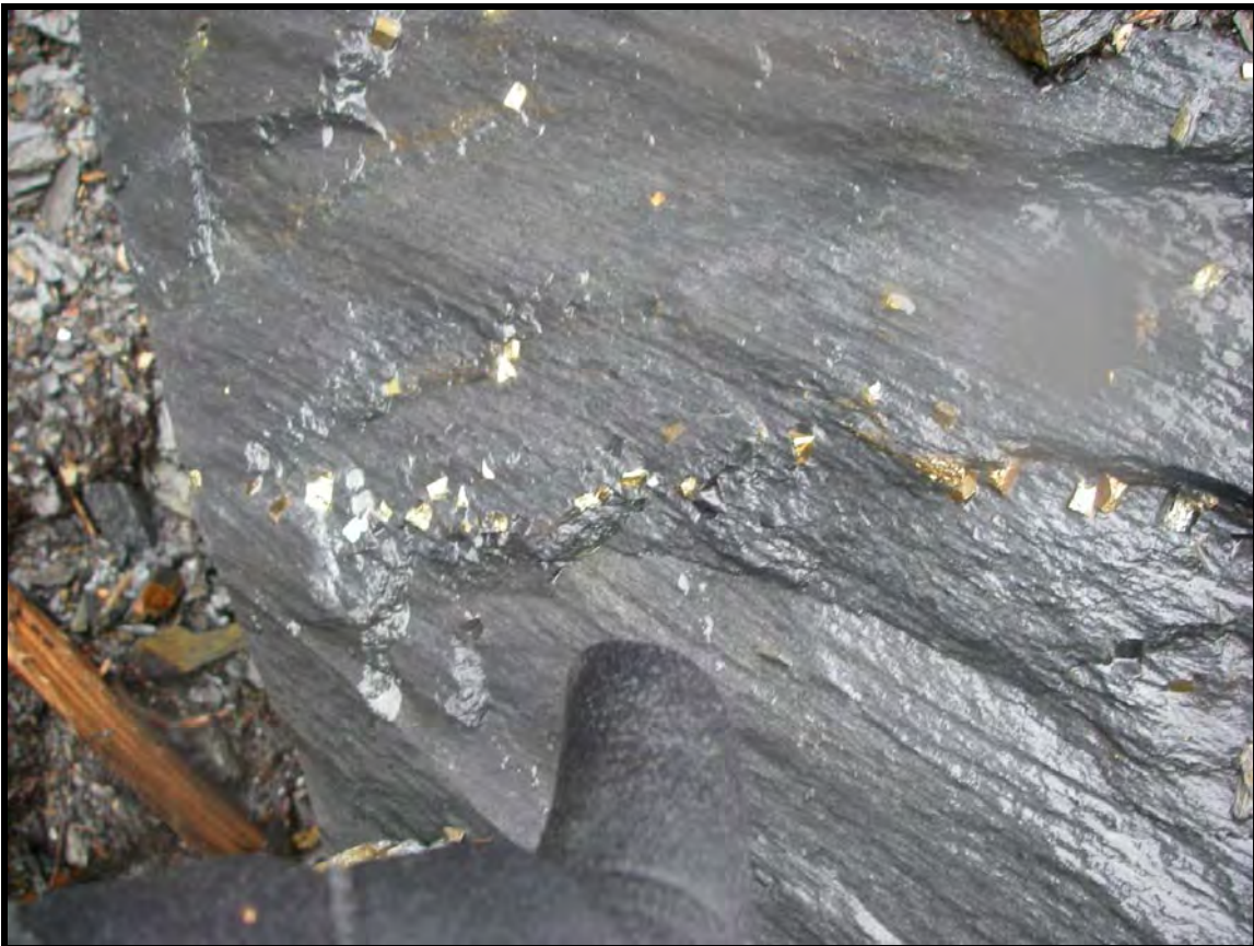
Photo 14: Typical pyrite occurrence in slates along the northeast area of MHT logging roads.