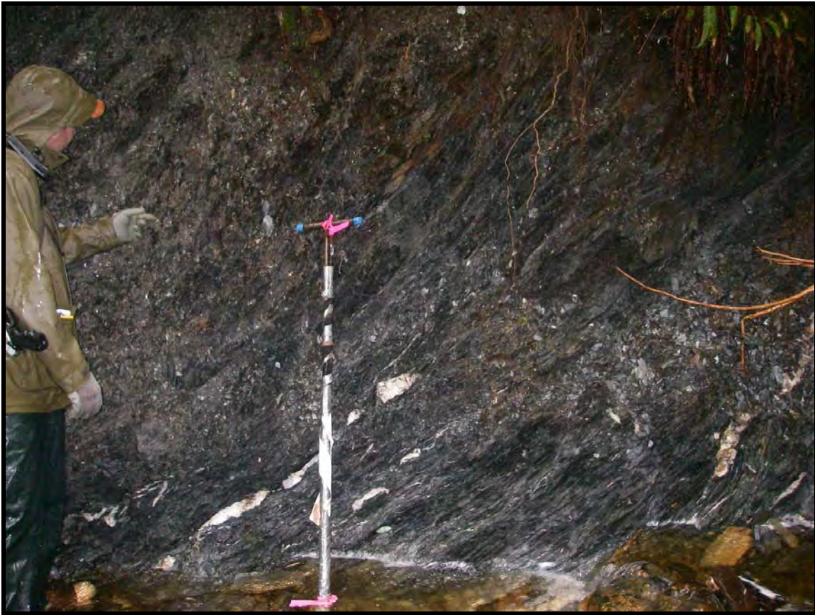
Photo 15: Slate outcrop in a steep sided creek on the north slope of Harriet Hunt Ridge.