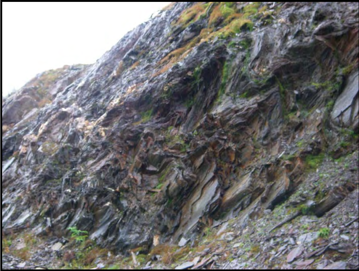
Photo 13: Highly deformed and weak outcrop of slate along the MHT logging roads.