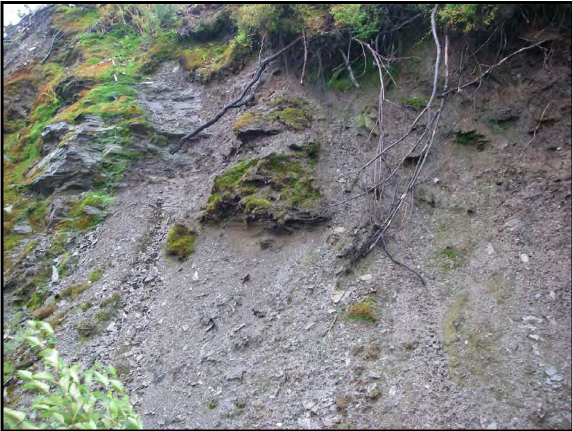
Photo 11: Severely weathered bedrock and residual soils along the MHT logging roads.