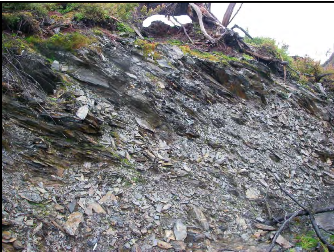
Photo 12: Poor quality slates exposed along the MHT logging roads.