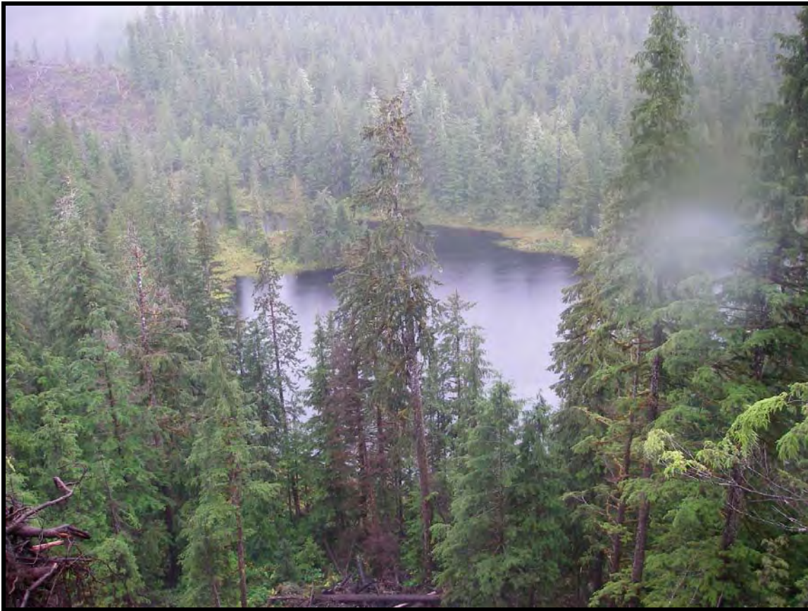
Photo 23: View to the northwest of outlet for Lake 340 from the existing logging roads