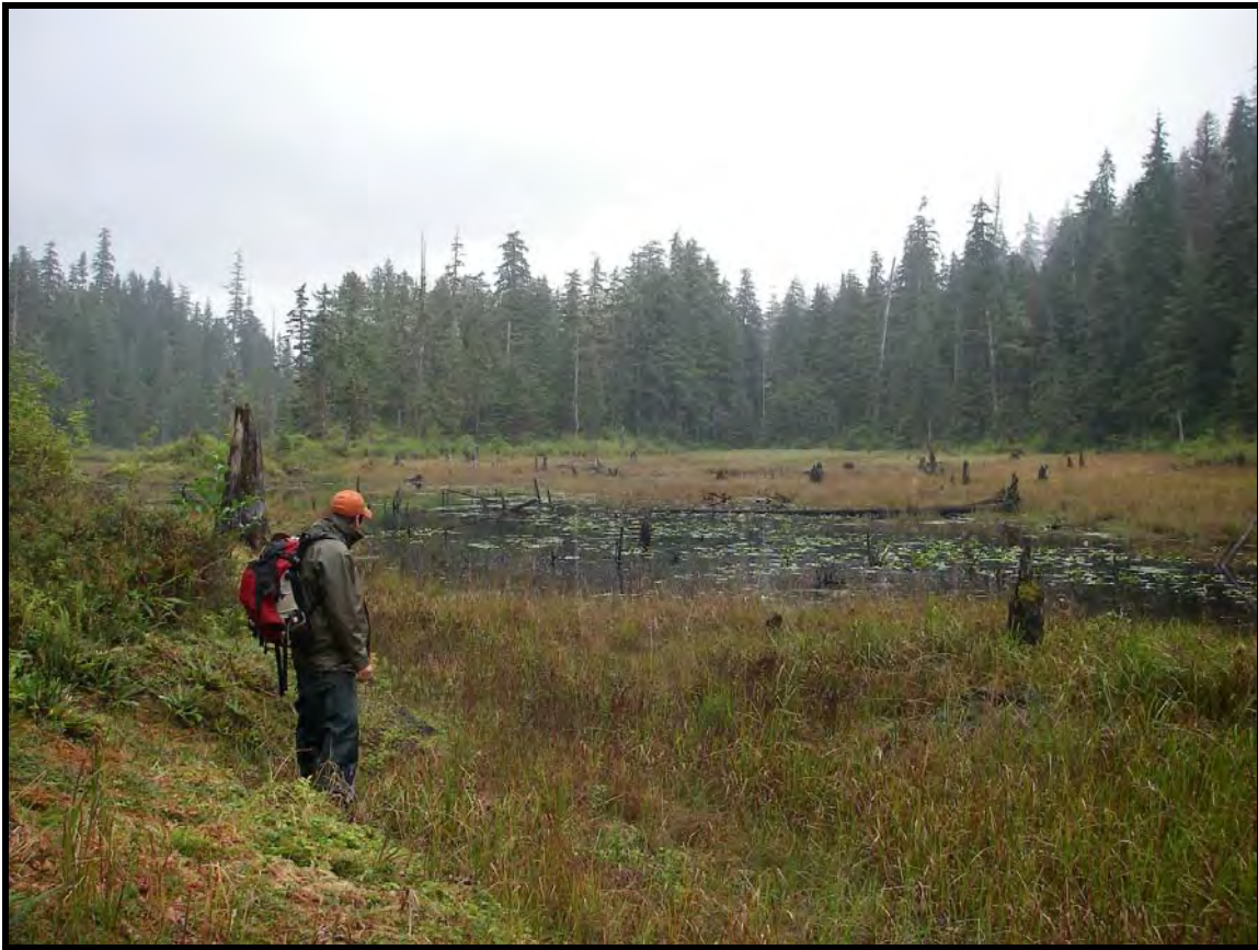
Photo 27: One of the small lakes with marshy fringe in the floor of Newt Valley.