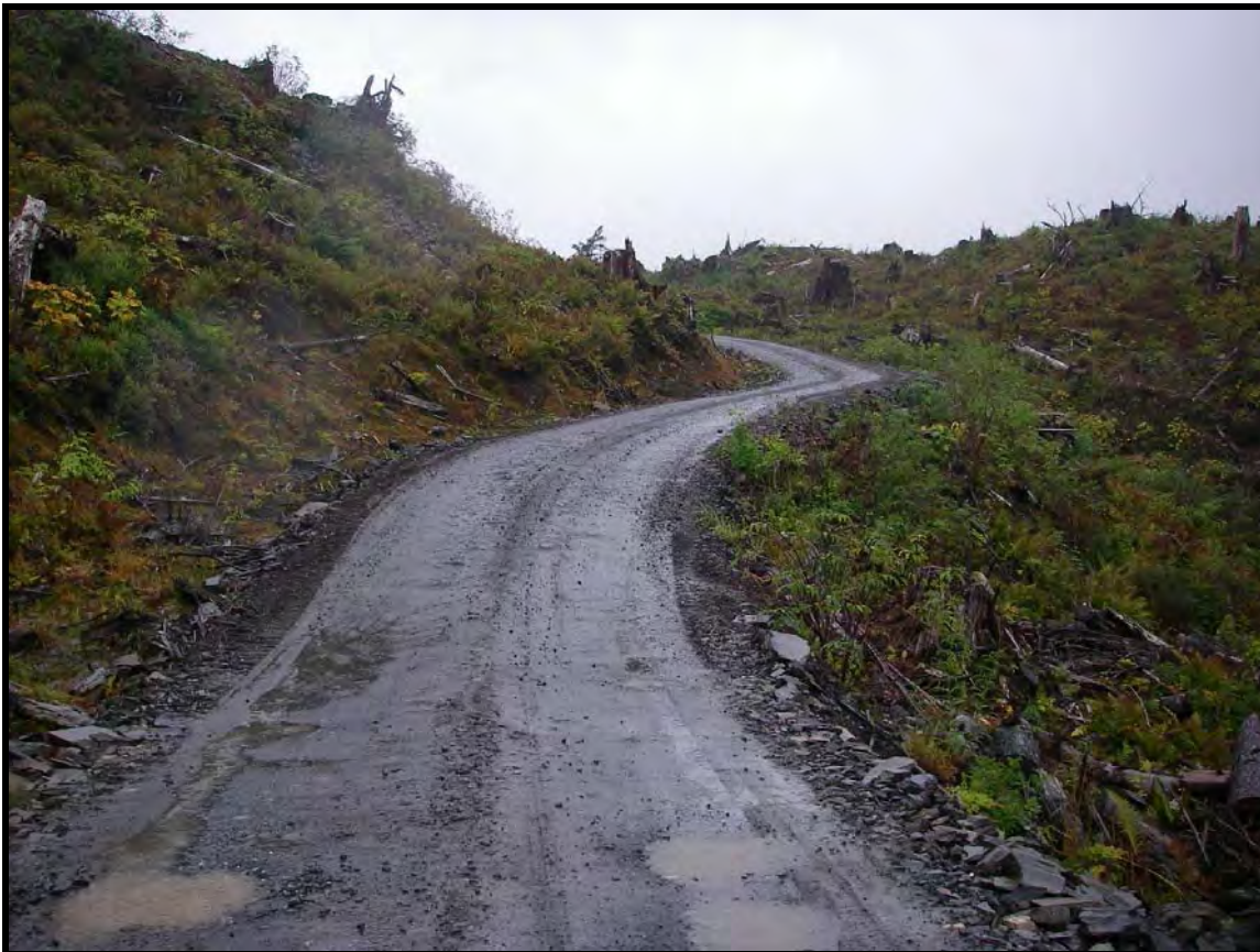
Photo 18: Typical MHT logging roads being utilized as part of the Option 5 corridor.