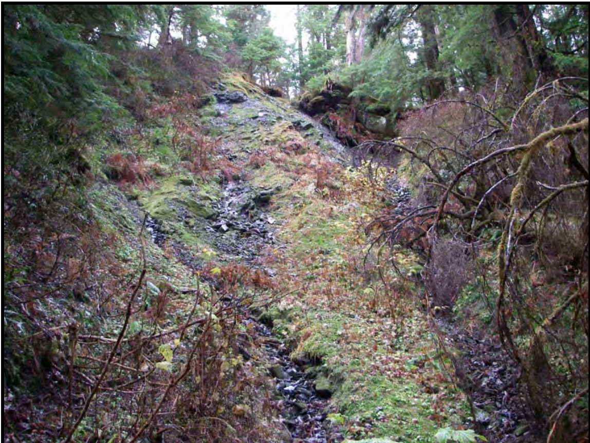
Photo 8: Steep hillside with mixed bedrock and shallow colluvium along the north slope of Harriet Hunt Ridge.