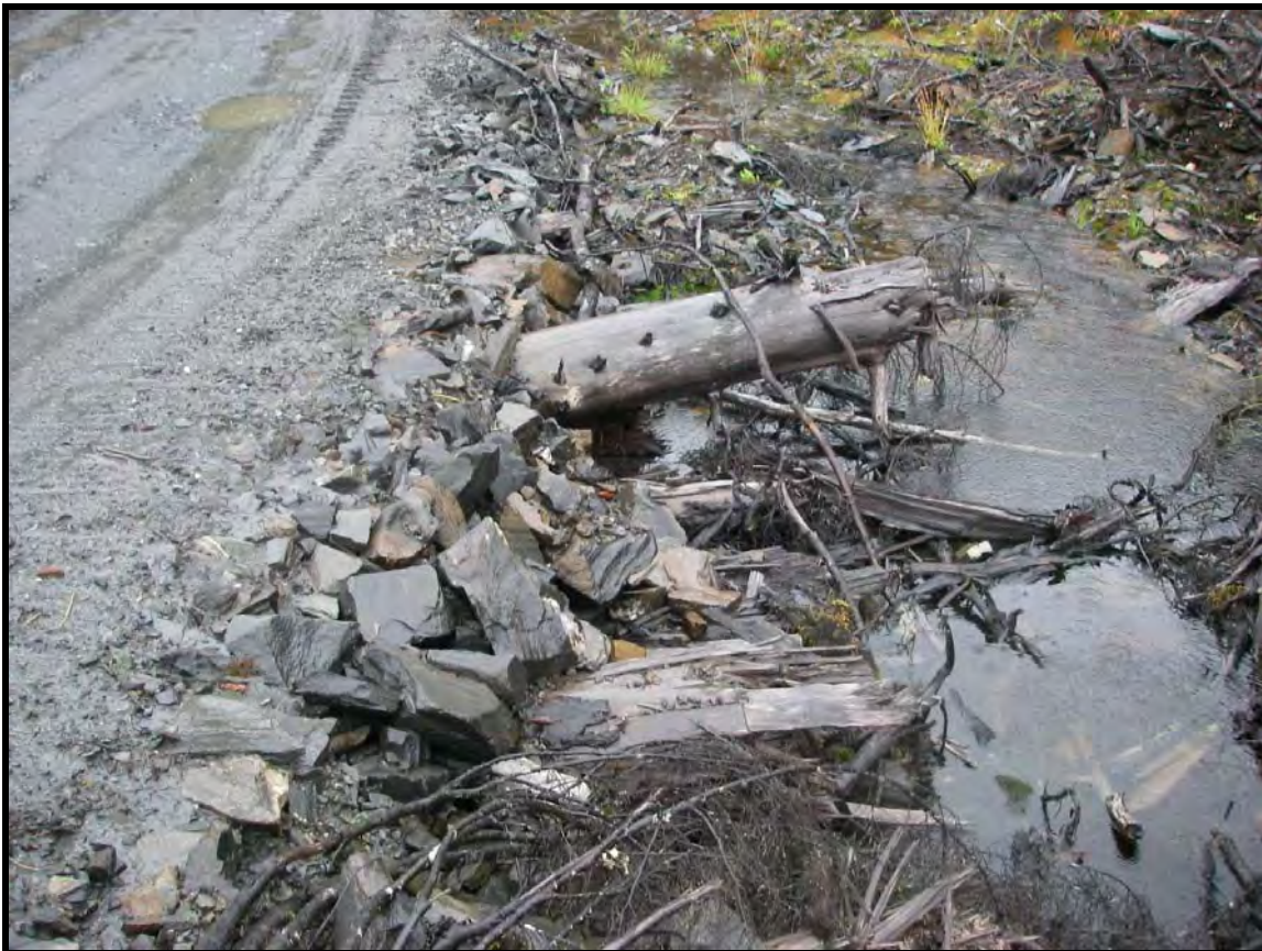
Photo 20: Typical corduroy construction with drainage passing through the roadway.