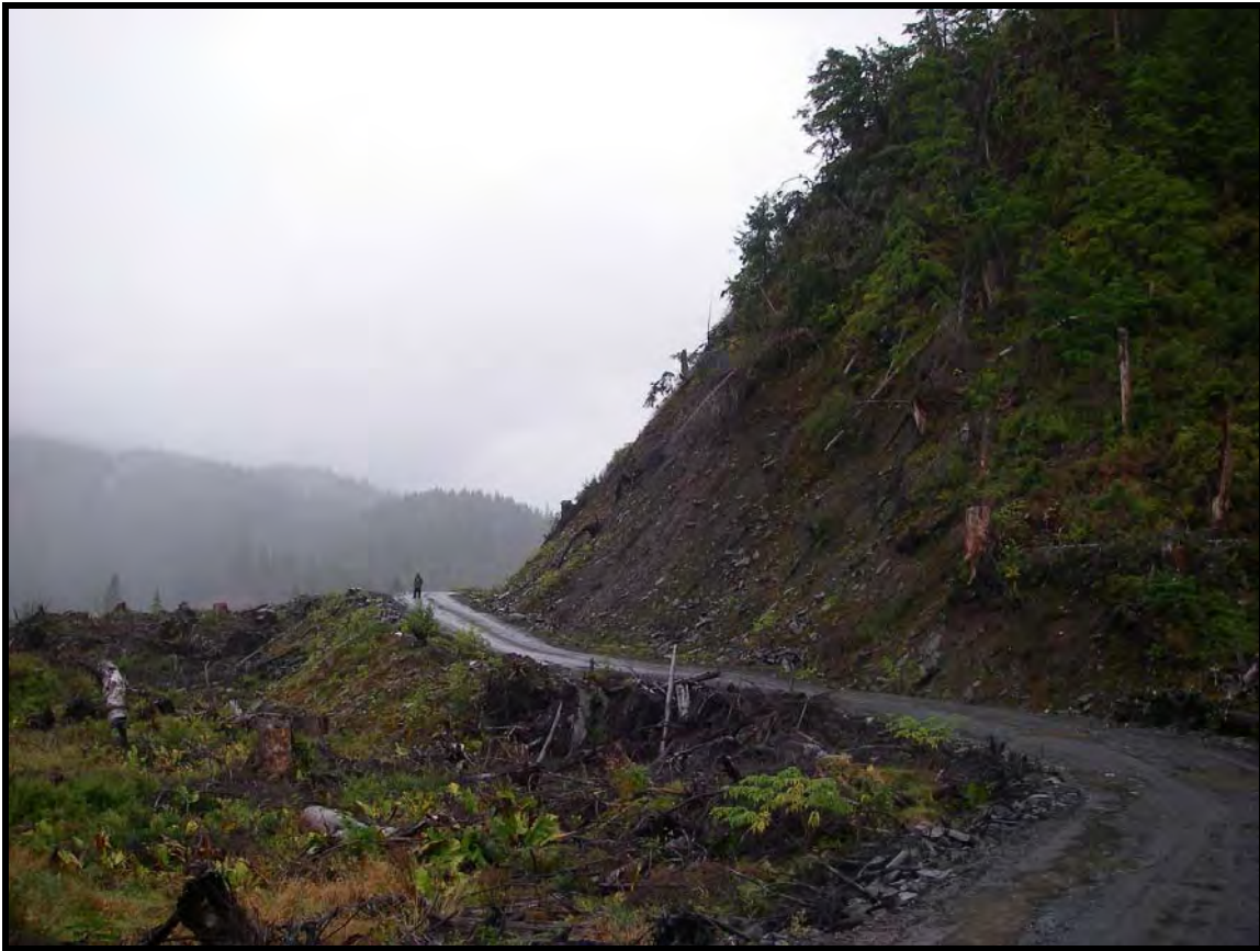
Photo 9: High, steep colluvium slope above logging roads northeast of Leask Lakes.