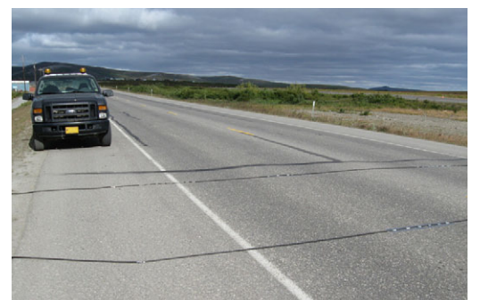
A portable/short-term traffic count in Nome

To view Northern Region traffic counts for past years, visit www.dot.state.ak.us/nreg/planning/traffic.shtml .