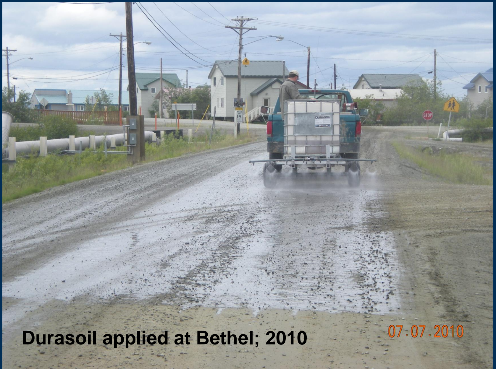
Durasoil applied at Bethel; 2010