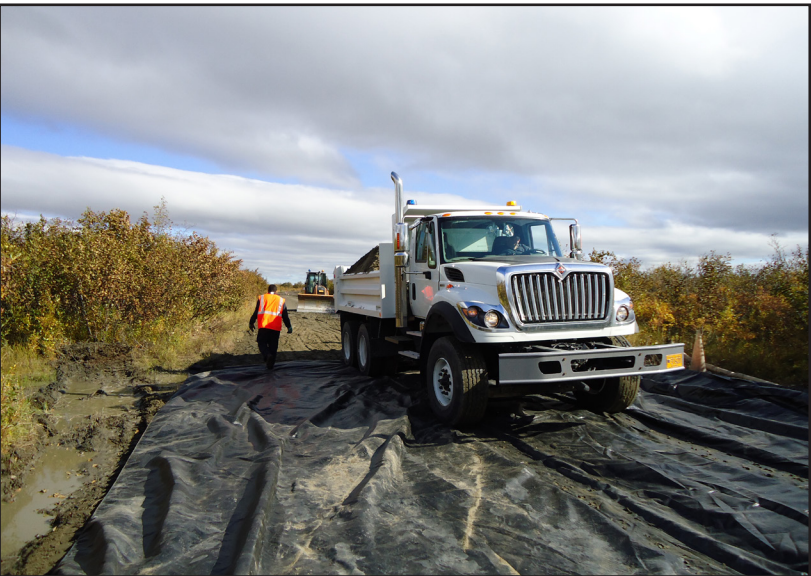
Hangar Lake Road Rehabilitation

Bethel Airport Pavement Rehabilitation - This $7.7 million project to resurface the existing runway was started in May 2012. The contractor had trouble producing the specified asphalt pavement mixture which caused delays during June, July and most of August. The initial repaving is currently scheduled to be completed in early September, at which point airport operations should return to normal. Repaving efforts will resume in the 2013 construction season (once pavement mixture is approved to reduce any construction delays and impacts on airport operations). Completion of the project is expected by July 2013.