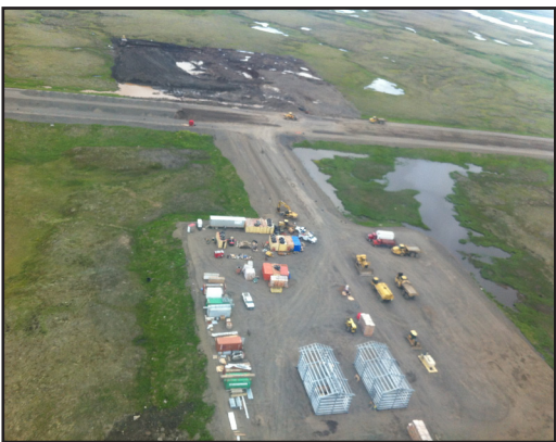
Construction of the Snow Removal Equipment Buildings at Chefornak Airport

Chefornak Airport Relocation -The new 3,200 x 60 foot airport opened to air traffic September 4. This $30.3 million project began in 2002 with embankment work to replace the 2,500 x 35 foot airport. The old airport is incorporated into the new 1.6 mile airport access road. Project includes 2 new snow removal equipment buildings and new snow removal equipment. A unique construction feature was the use of an ice road to access good material about 6 miles from the village. QAP finished the project ahead of schedule and within budget.