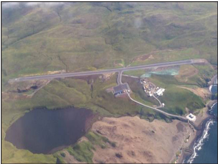
New Airport on Akun Island to serve Akutan

http://www.dowlhkm.com/projects/SWAKTP/new_website/index.html