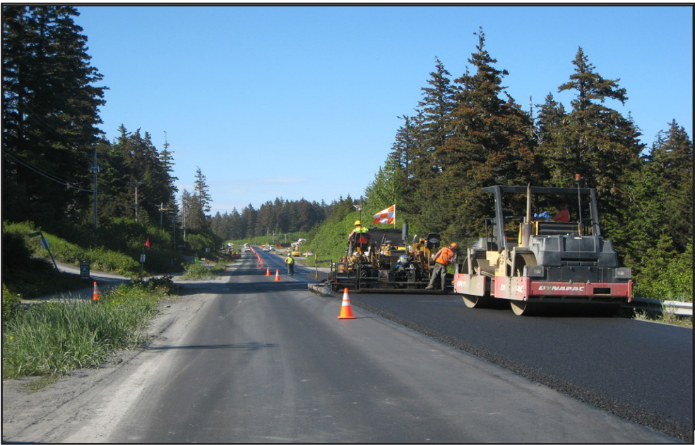
The Rezanof Drive Resurfacing project from the Kodiak Wye to Monashka Bay Road received nearly $6 million in federal "core formula" funds to repave, install guardrail upgrades, curb ramps, drainage improvements and school zone upgrades. Project is expected to be completed by the end of October 2012.