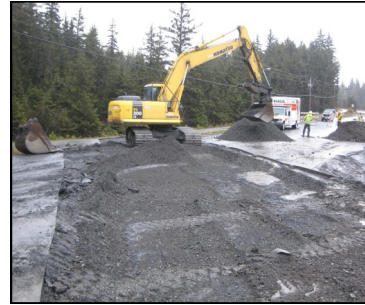
Rezanof Drive Culvert Installation Spring 2012