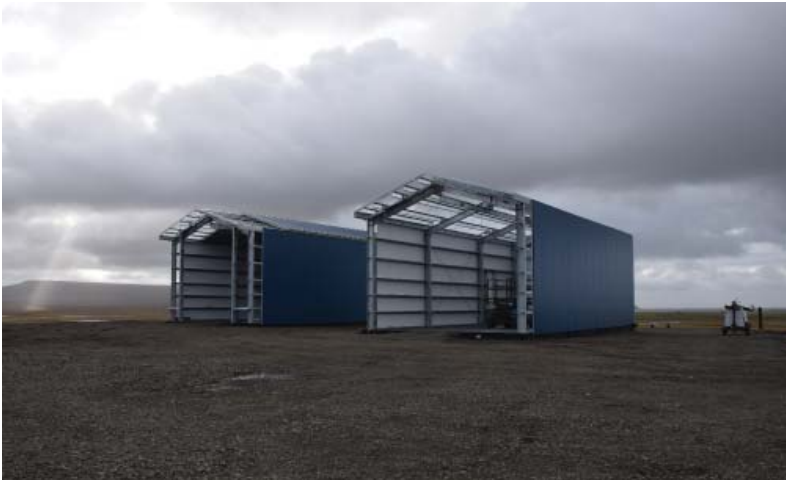
Partially completed Tununak Airport equipment buildings

The project is scheduled for completion by October 31, 2015. The new road and bridge was completed this year as well as the base embankment. The contractor has been crushing locally produced rock for the sub base. Two snow removal equipment buildings are currently 50% complete. For more information contact Matt Morrow at (907) 269-0466 or matthew.morrow@alaska.gov .