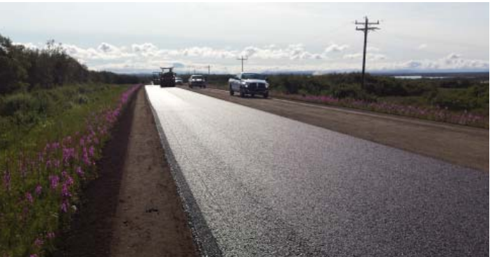
Fresh asphalt on the traveled lanes and shoulder of the Alaska Peninsula Highway