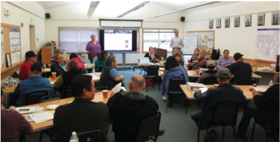
Tribal Leadership from over 30 village comment on the process and progress of the Southwest Area Transportation Plan at their September 17 meeting in Dillingham.

The online survey asking for input is still active through October 3 at www.swaktransplan.com . For more information, please contact Joselyn Biloon at joselyn.biloon@alaska.gov or (907) 269-0508.