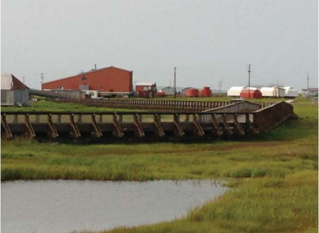
New boardwalk in Kipnuk

Nearly four miles of new boardwalks were recently completed by Northern Construction Service, using approximately 60% local hires. Two boardwalk styles, “at-grade” and “elevated”, were designed to withstand the seasonal flooding and minimize disturbance to the sensitive tundra. Final project completion is scheduled for mid-October 2014. For more information contact Laura Paul at (907) 269-0463 or laura.paul@alaska.gov .