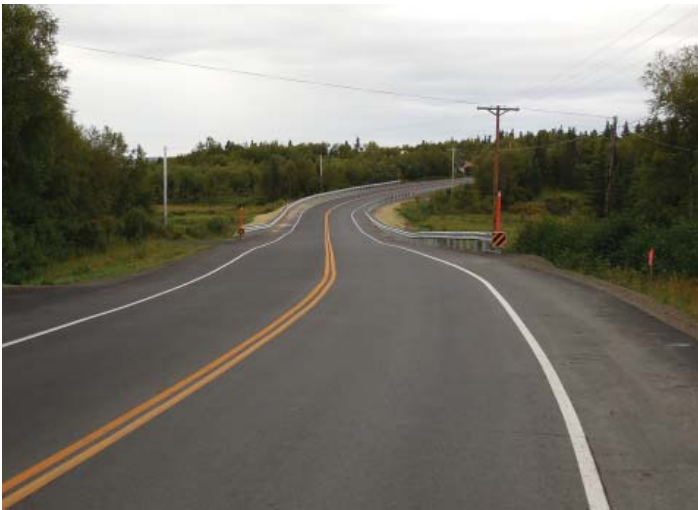
New asphalt and striping on Kanakanak Road

Knik Construction completed the Alaska Peninsula Highway Pavement Preservation project September 2014. Work included paving the roadway and shoulders, adding new guardrail and end treatments, drainage, signs, and striping. For more information, contact Brian Schumacher at (907) 269-0450 or brian.schumacher@alaska.gov .