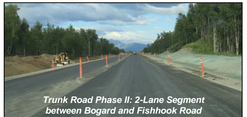
Trunk Road Phase II: 2-Lane Segment between Bogard and Fishhook Road