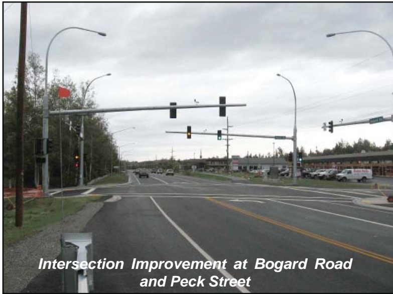
Intersection Improvement at Bogard Road and Peck Street