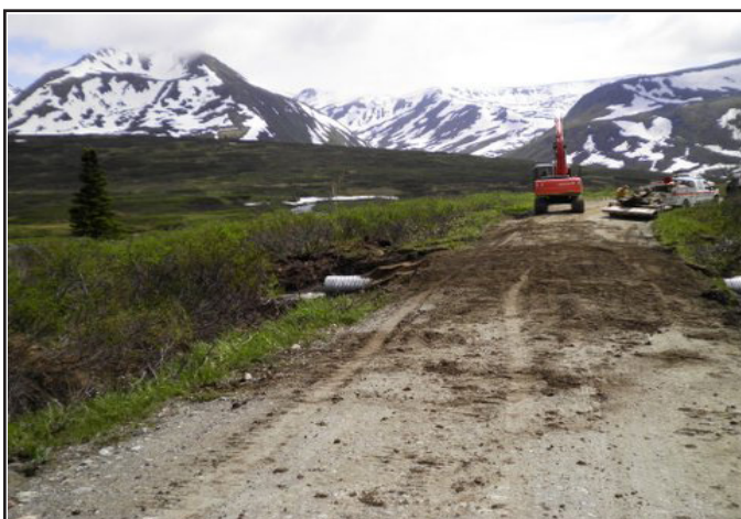
Hatcher Pass Road Maintenance Work

Glenn Highway Signing Replacement and Repair – Anchorage to Palmer - Work continues on this project with intermittent lane closures.