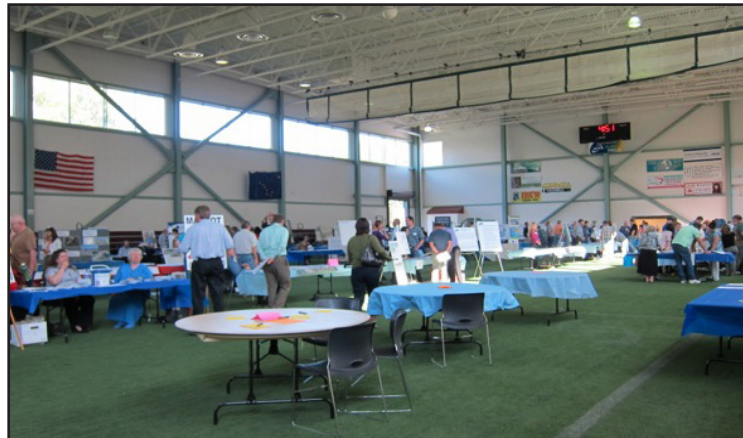
The fifth annual Mat-Su Transportation fair was held this year at the Menard Sports Center. Over 400 people attended. More information can be found at http://matsutranspofair.blogspot.com/