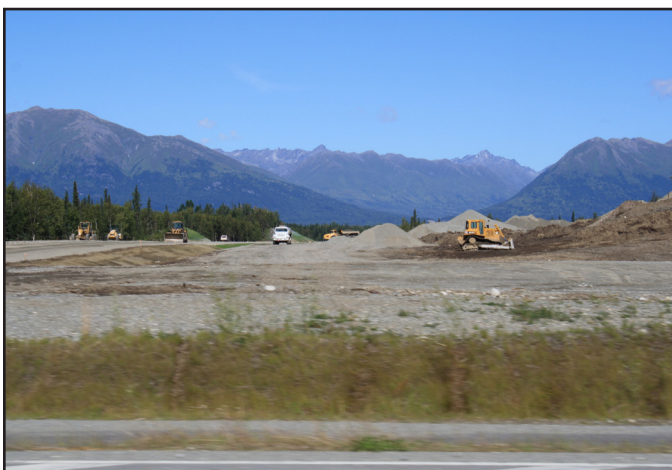
Trunk Road Reconstruction Phase II

Trunk Road Reconstruction Phase II – Palmer-Wasilla Highway to Palmer-Fishhook Road - Substantial progress on major earthwork was accomplished this season with construction continuing next summer. Traffic will continue using Old Trunk Road through the winter. Palmer-Fishhook Road improvements are complete with new fish-friendly culverts installed. Work will continue through mid-October and then shut down for the winter. More information can be found at: