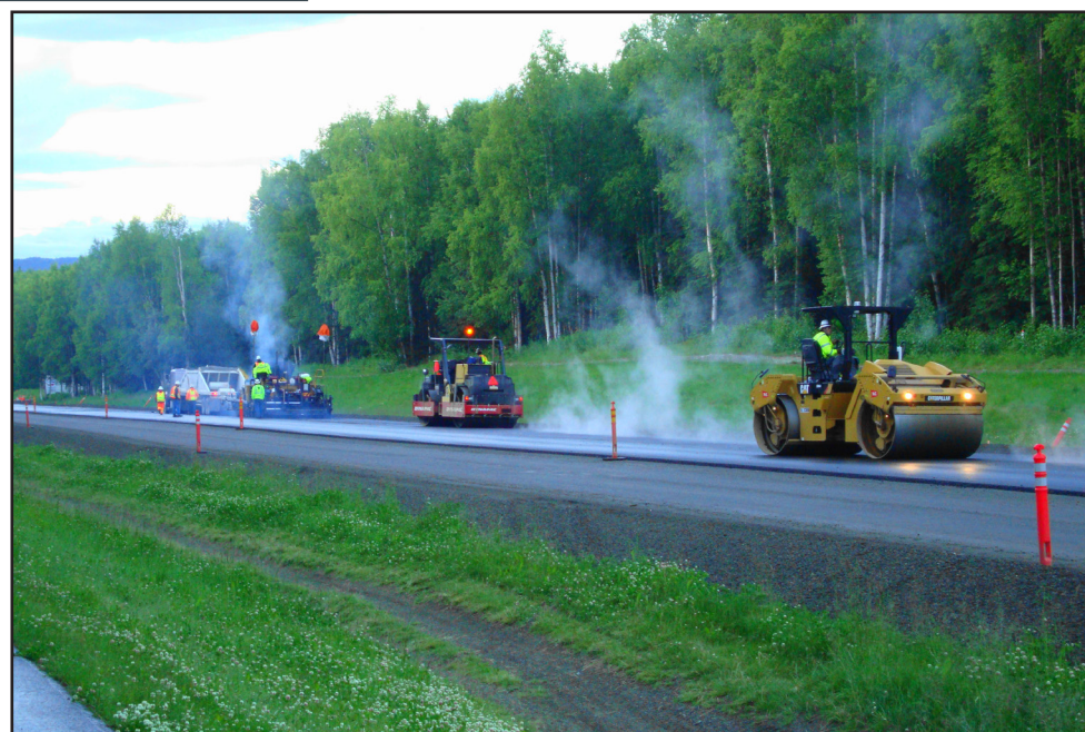
ADOT&PF was able to use $6.5 million core formula funds this summer for the Parks Highway MP52-57 Rehabilitation project.