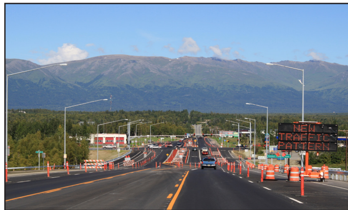
Seward Meridian Reconstruction Phase I

http://projects.hdlalaska.com/_current_projects/Parks83to90/project%20overview.html