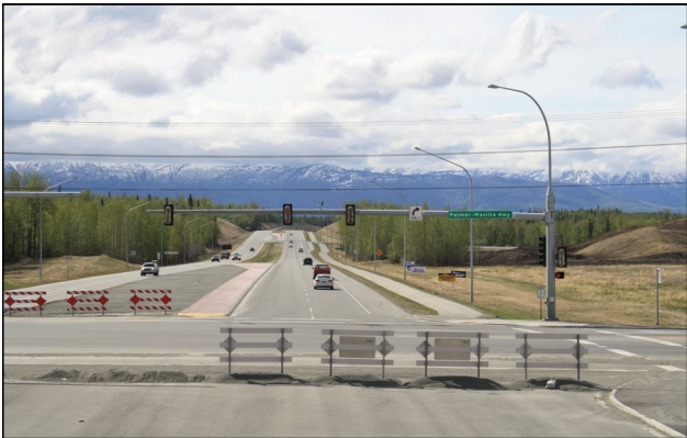
Completed Trunk Road looking south from Palmer/Wasilla Highway (May 2012)