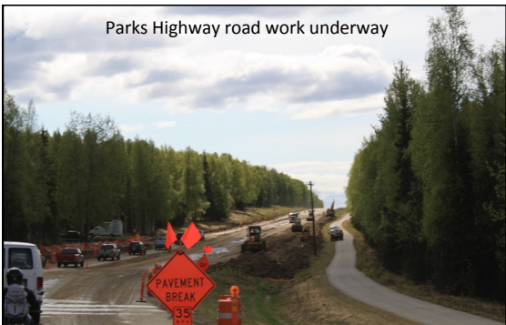
Parks Highway road work underway

Parks Highway: MP 52 - 57 - This project will resurface the highway to address pavement deterioration for a length of five miles with selective excavation and replace of the underlying roadbed to address subsurface failures. Periodic lane closures will occur. Construction is underway and completion date is September 2012.