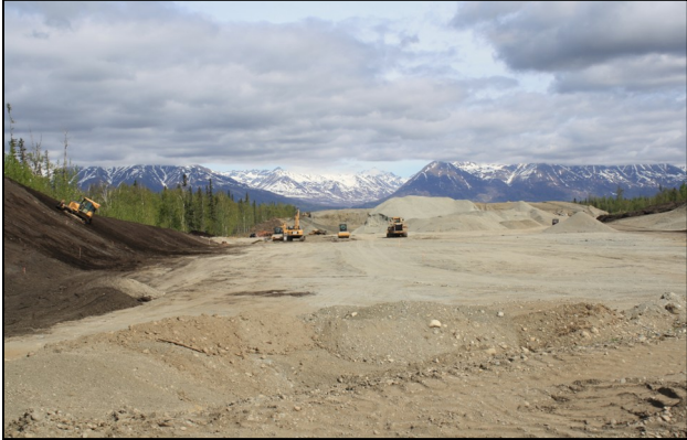
Trunk Road earthwork underway just north of Palmer/Wasilla Highway (May 2012)