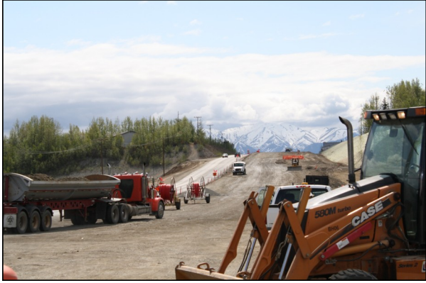
Seward Meridian earthwork nearing completion just south of Palmer/Wasilla Highway (May 2012)

Trunk Road - Phase I from the Parks Highway to Palmer Wasilla Highway is complete. Phase II is currently under construction and there will be four lanes from the Palmer-Wasilla Highway to Bogard Road, and two lanes from Bogard Road to Palmer Fishhook Road. Completion is scheduled for August 2014. http://www.trunkroad.com/ Seward Meridian Phase I - This project upgrades the road from the Parks Highway to just beyond the Palmer-Wasilla Highway to four lanes with a center left-turn lane and a separated pathway. Construction has begun with major earthwork underway and utilities being laid. Paving is expected to start around June 6th and run through June 22nd. There are not anticipated to be any road closures or major detours. Completion of Phase I is expected in 2013.