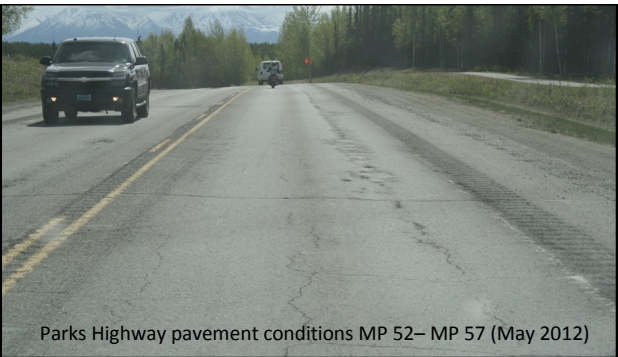
Parks Highway pavement conditions MP 52– MP 57 (May 2012)

Parks Highway: MP 52 - 57 - This project will resurface the highway to address pavement deterioration for a length of five miles with selective excavation and replace of the underlying roadbed to address subsurface failures. Periodic lane closures will occur. Construction is underway and completion date is September 2012.