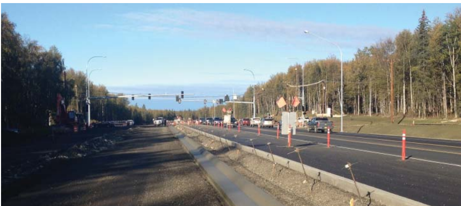
Parks Highway MP 43.5-44.5 at Church Street.