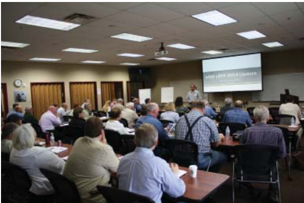
The LRTP Update project team held a recent workshop on the current and future needs of the Mat-Su transportation system and the challenges of how to pay for improvements in a time of fiscal constraint.