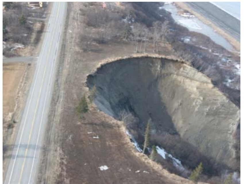
The Department is currently requesting bids to address the erosion at MP 153 of the Sterling Highway.