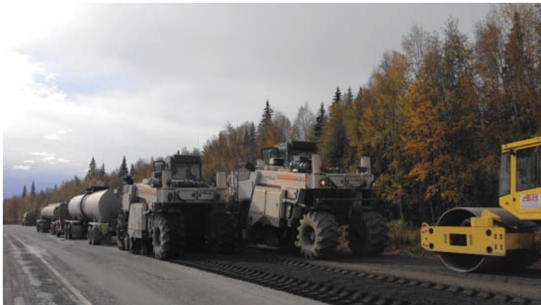
Paving on Parks Highway MP 123.5-146.