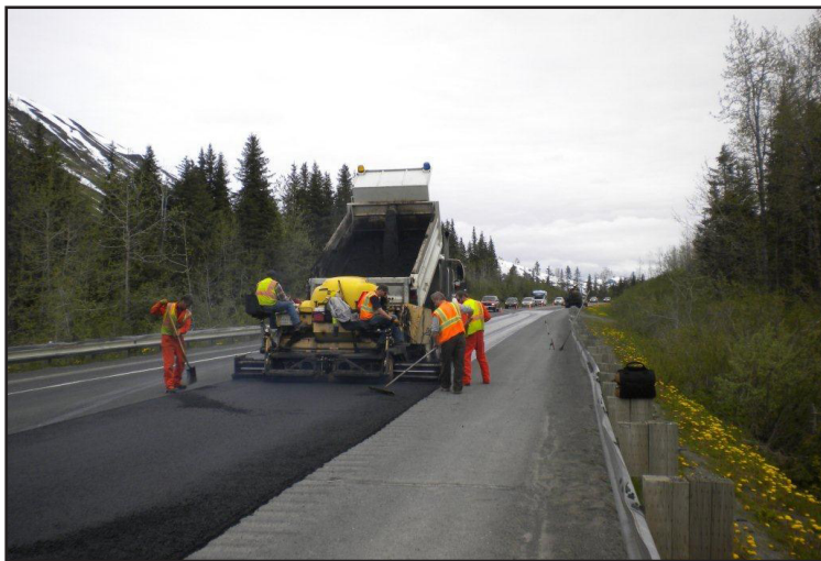
Maintenance crew resurfacing Turnagain Pass area on the Seward Highway