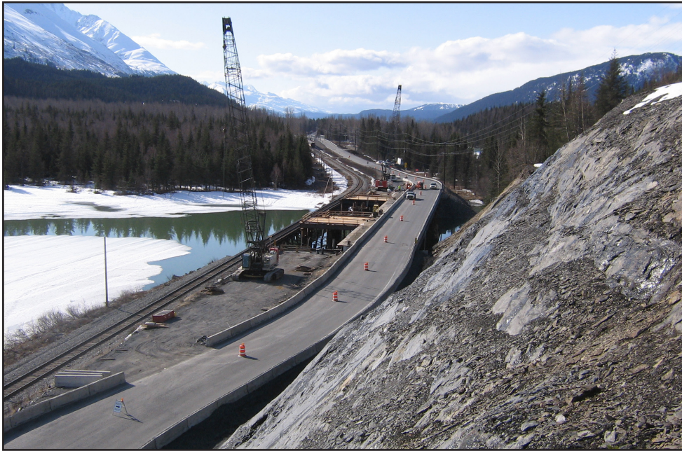
The Seward Bridges Replacement project replacing bridges at Ptarmigan Creek, Falls Creek and Trail River has received over $ 27 million dollars in federal "core formula" funds.