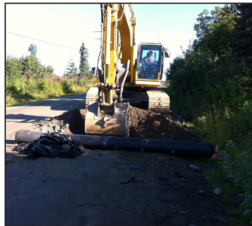
Greer Road culvert replacement

Tire Changeover - Studded tires are allowed on all paved highways and roads north of 60 degrees North Latitude (just north of Ninilchik) and on the Sterling Highway both north and south of Ninilchik beginning September 16th . For all other paved roads south of 60 degrees North Latitude, studded tires are allowed beginning October 1st . Additional information can be found at the Alaska Department of Motor Vehicles website: http://doa.alaska.gov/dmv/faq/faq.htm