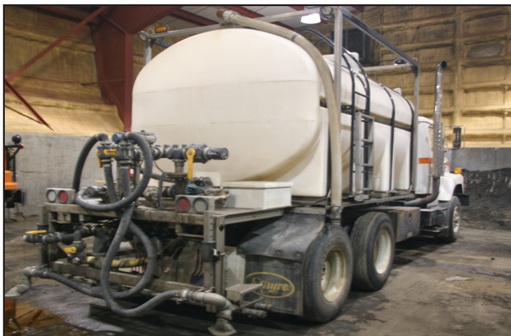
ADOT&PF Salt Brine Truck

Sterling Highway: MP 37-45 Pavement Preservation - Paving should be finished mid-September 2012. This $5 million project will also include guardrail upgrades, drainage improvements and minor bridge work. The completion of all remaining project elements is expected next summer.