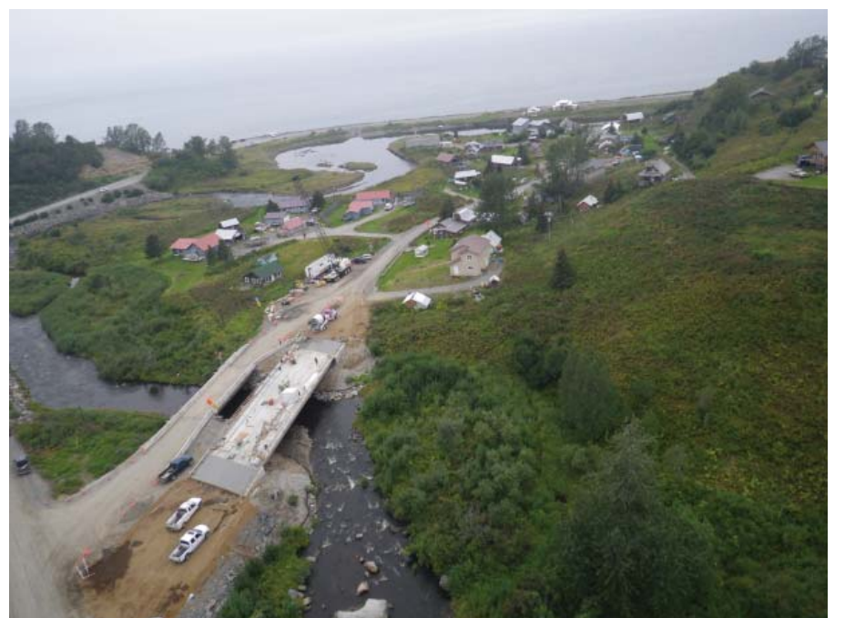
The newly installed Ninilchik Village Bridge.

The new bridge is open to traffic. Signage and guardrails will be installed and project completed by October 1st. For more information contact Alan Drake at (907) 269-0665 or alan.drake@alaska.gov .