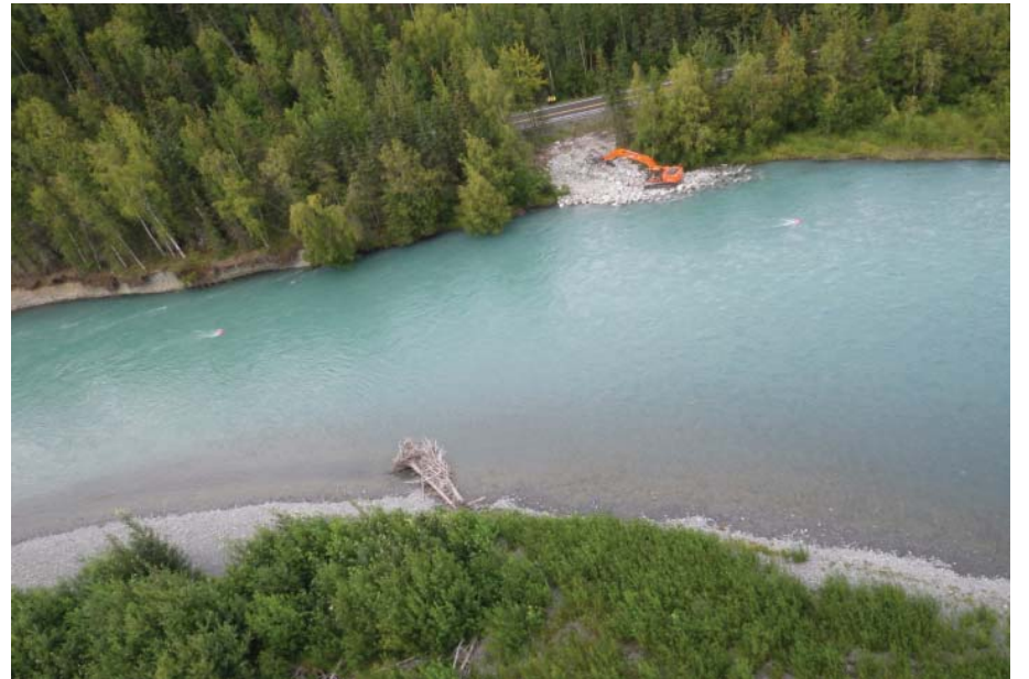
Erosion control along the Sterling Highway at MP 57