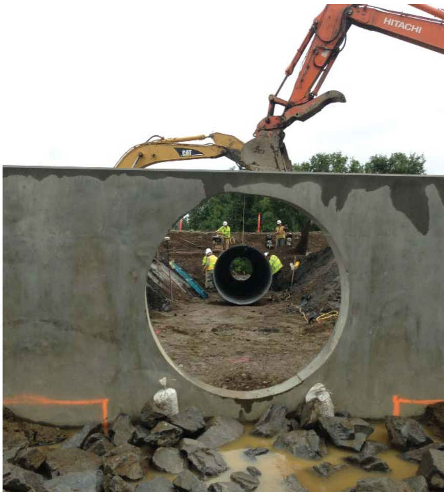
Installation of large culvert at MP 4.3 of East End Road

Further down the road, the five major digouts and ditching will be completed and the digouts paved with a better lift of asphalt prior to shutdown. Final paving and project completion will occur in 2015. For more information contact Laura Paul at (907) 269-0463 or laura.paul@alaska.gov .