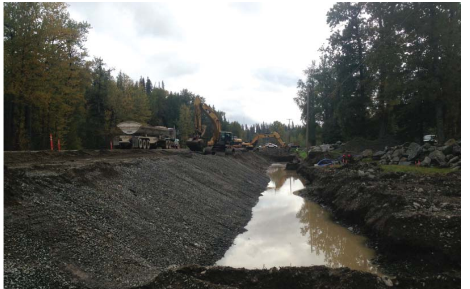
Building up the road embankment for slow vehicle turnout areas on the Sterling Highway