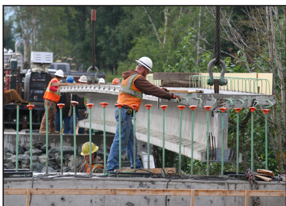
Seward Highway Frontage Road Girder Placement - Homer Drive Bridge

Victor Road - Construction is underway to upgrade the roadway to a 3-lane section, and includes pedestrian facilities, lighting, storm drainage, and landscaping. During the remainder of construction, two lanes and a sidewalk will remain open to traffic. Construction is expected to be completed next summer.