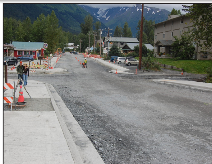
Girdwood Street and Drainage Improvements: Hightower Road - Work in Progress. This is a Municipal project funded by congressional earmarks, constructed by ADOT&PF

Seward Highway: MP 89 to 96.6 Resurfacing - Construction is underway to resurface the Seward Highway from historical MP 89 near Girdwood to historical MP 96.6 near Bird Point. Weather permitting, this project is scheduled to be completed by the middle of September.