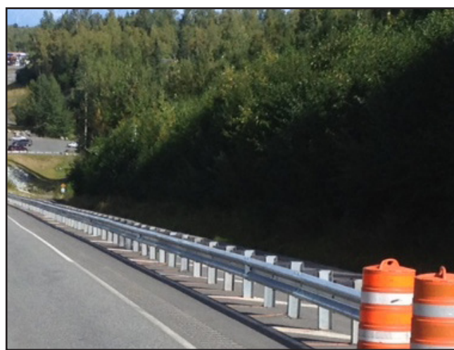
Responding to public input, ADOT&PF installed guardrails separating vehicle traffic from the pathway along the Old Glenn Highway near Chugiak Elementary School.

Tire Changeover - Studded tires are allowed on paved highways and roads in Anchorage beginning on September 16th . Additional information can be found at the Alaska Department of Motor Vehicles: http://doa.alaska.gov/dmv/faq/faq.htm