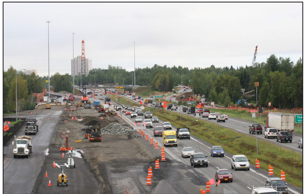
Seward Highway Expansion received over $40 million in federal "core formula" funds during the 8 years of SAFETEA-LU and subsequent Continuing Resolutions to complete the section from Dowling Road to Tudor Road.