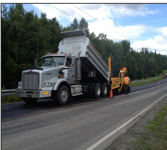
Deferred Maintenance funds being used to repave a portion of Birch Road.