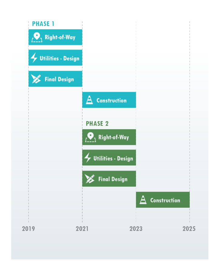
Figure 3: Project Timelines

The project teams are refining the proposed designs based on additional survey, hydrology, geotechnical field work, and public input. Due to the significant amount of utility relocation required in the corridor, DOT&PF has worked closely with those companies on a preferred utility alignment. ROW acquisitions are needed to implement many of the proposed design elements including utility relocation, drainage features, and secondary road connections. ROW efforts for Phase 1 started in Spring 2020 and will continue through Summer 2021. More than 150 properties will be impacted. The project team hosted an open house meeting in February 2020 for potentially impacted property owners in Phase 1 to talk one-on-one with the project team.