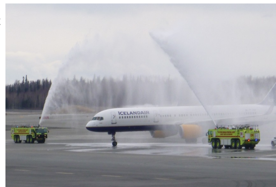
Water cannon salute for Icelandair, May 15, 2013

We had a wonderful time welcoming passengers from the inaugural Icelandair and Virgin America flights earlier this summer. New carriers join a robust group of airlines providing service to Anchorage: Air Canada, Alaska Airlines, American Airlines, Condor, Delta, Frontier Airlines, Japan Airlines, Jet Blue, Korean Air, Sun Country Airlines, United, US Airways, and Yakutia Airlines all offer service throughout the summer months.