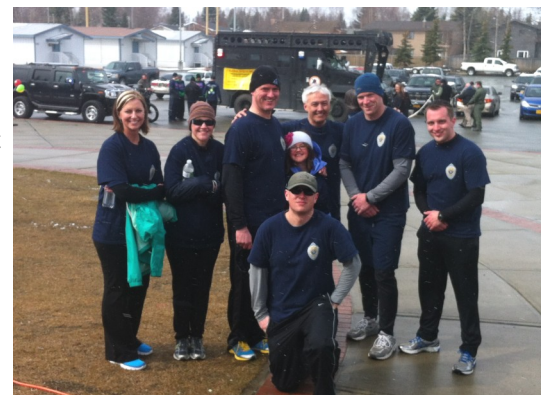
Anchorage Torch Run Team