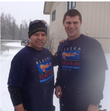
Mat-Su Valley Torch Run Team

Officers from all over the Alaska participated in the Annual Law Enforcement Torch Run for Special Olympics on May 18, 2013.