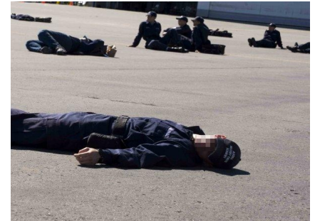
Triennial