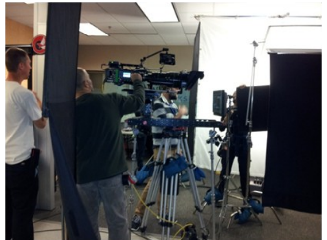
Behind the scenes at the commercial shoot.

— Article and photos by ANC Leasing Staff