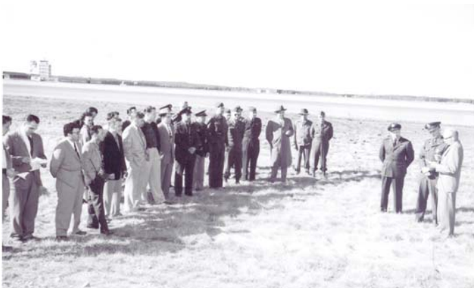
Above: Civilian and military officials gather at Anchorage International Airport to witness groundbreaking ceremonies at the site of the new $717,746 Alaska Air National Guard Hanger and Facilities